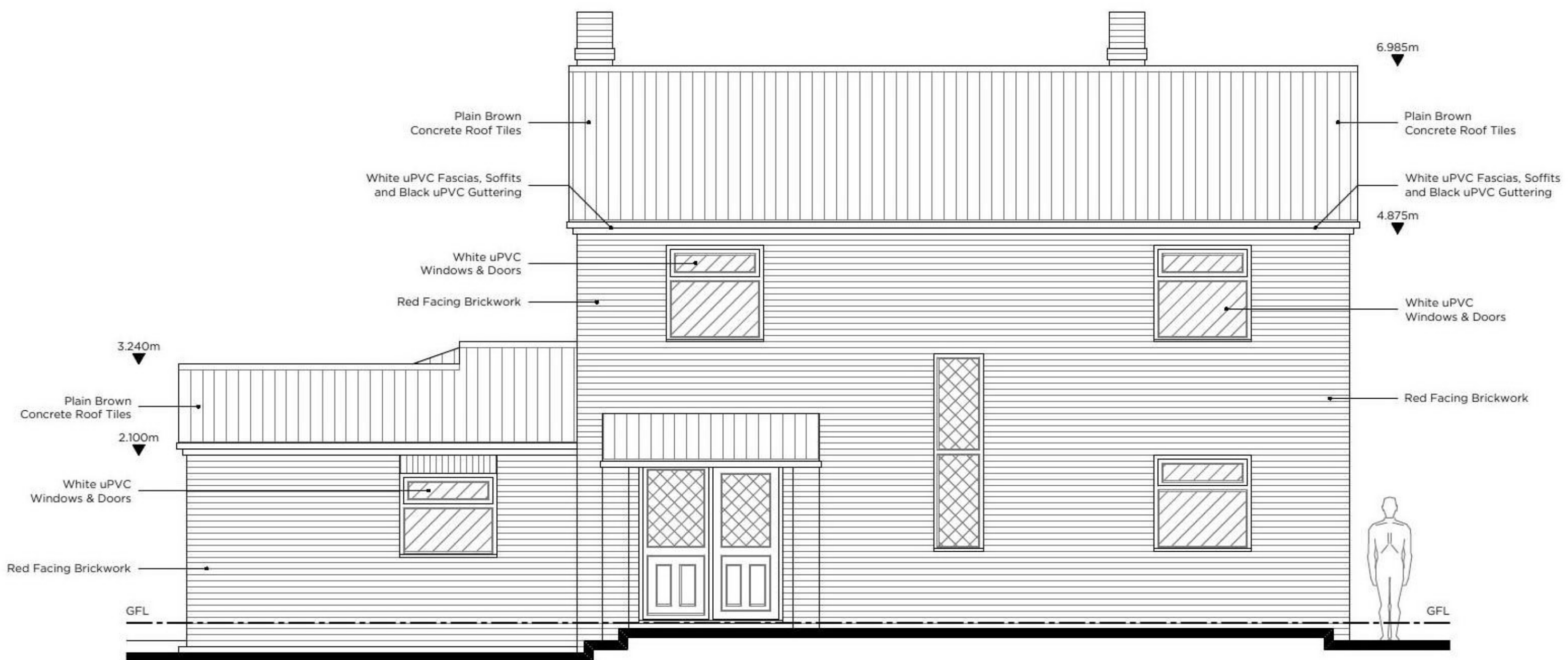
4.1 Existing Front (North) Elevation Scale 1:50