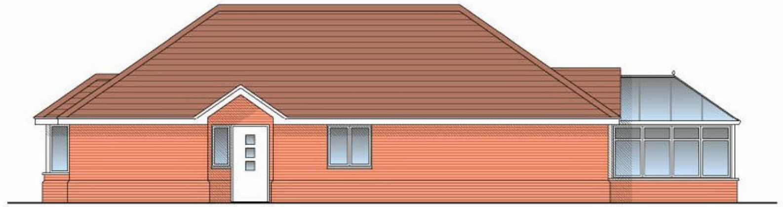
SIDE ELEVATION (MAIN ENTRANCE)