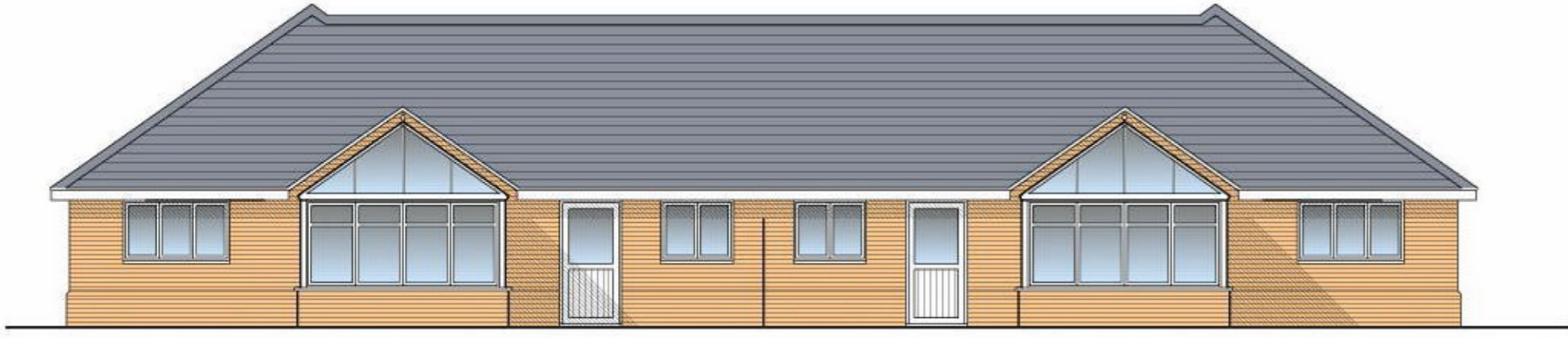
REAR ELEVATION PLOT 10