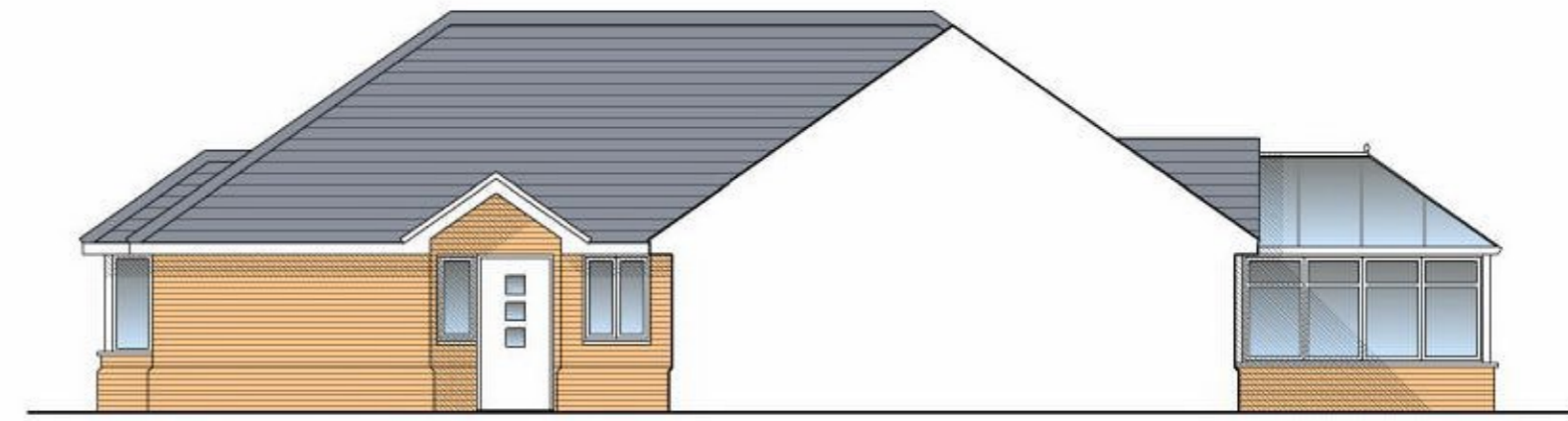
MAIN ENTRANCE (plot 9)