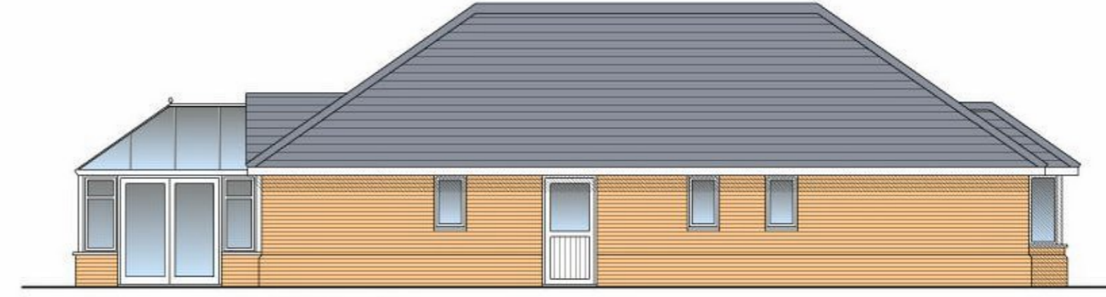
SIDE (plot 9)