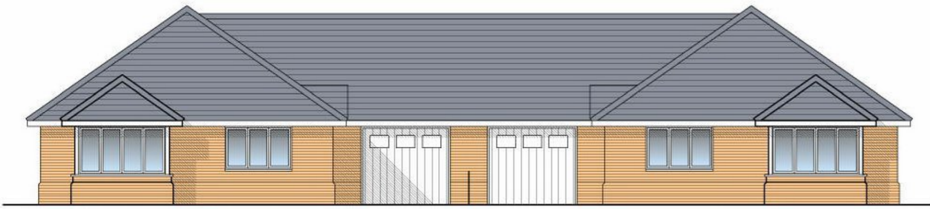
FRONT ELEVATION PLOT 9