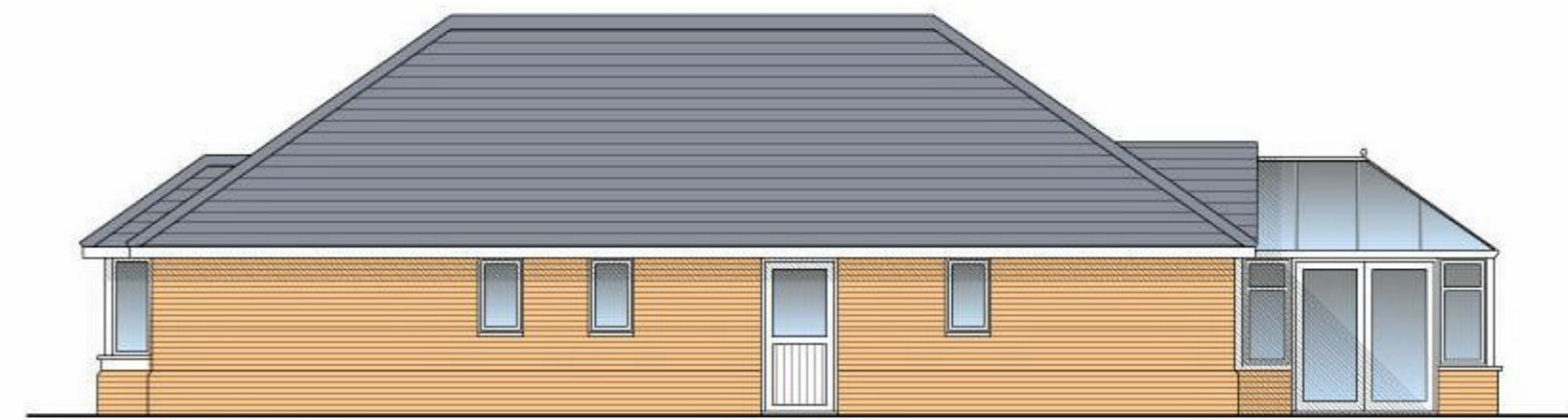
SIDE (plot 10)