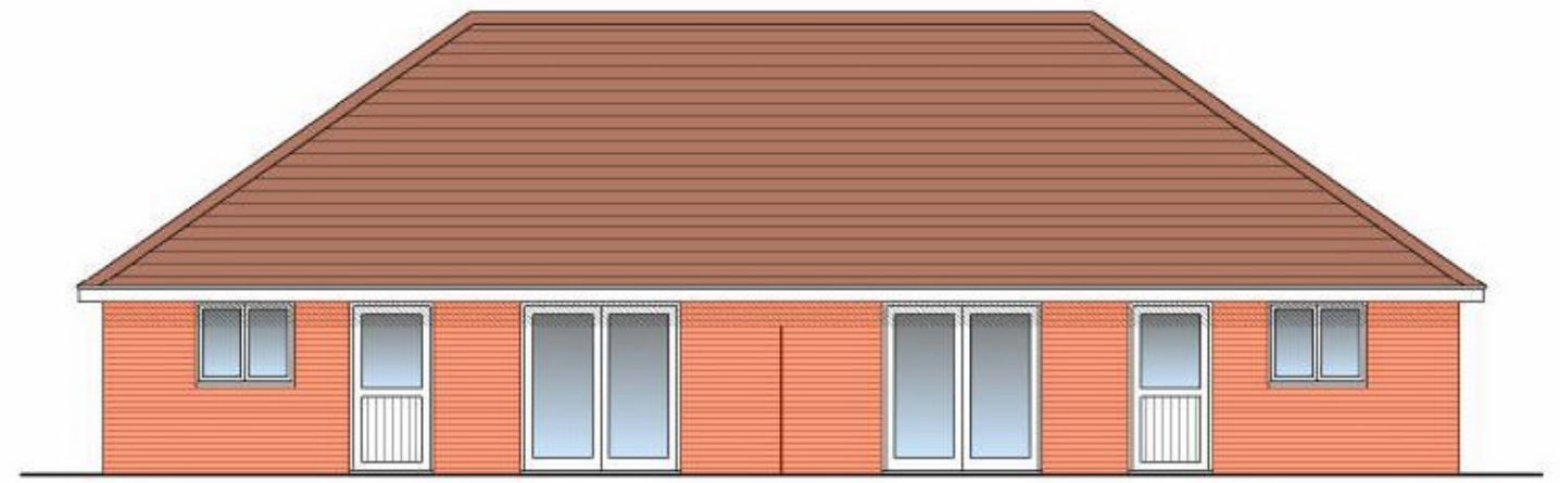
REAR ELEVATION 22