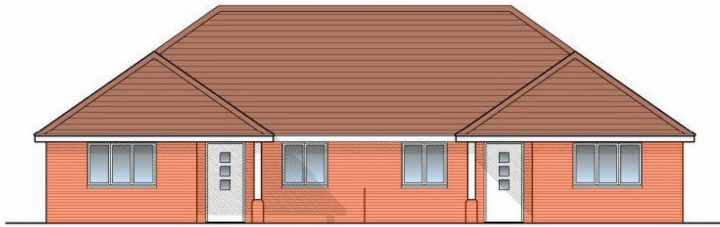
FRONT ELEVATION 21