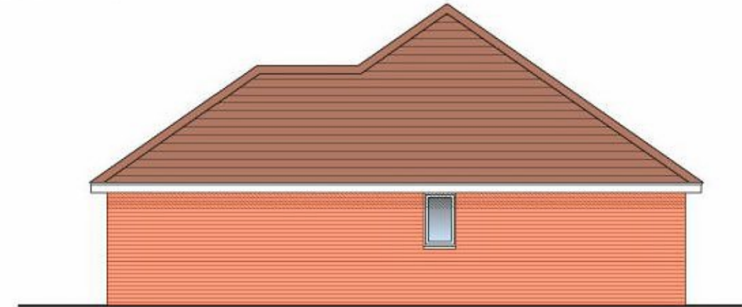
END ELEVATION 22