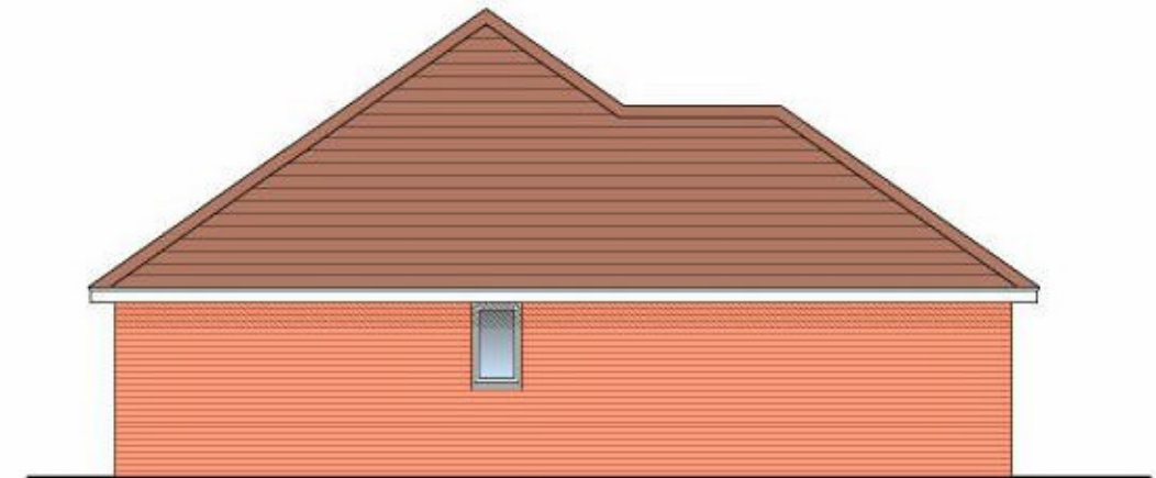
END ELEVATION 21