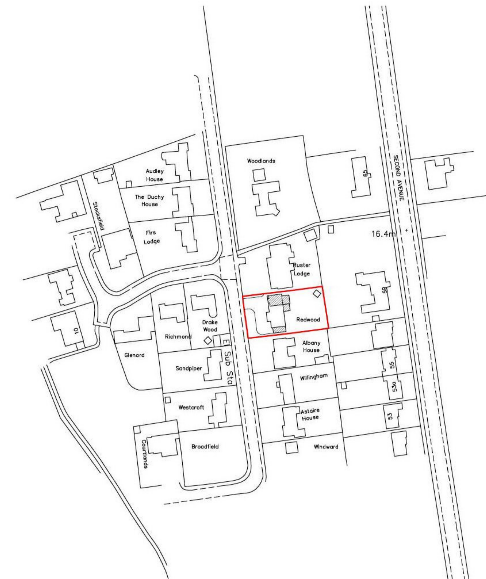
Existing Location Plan 0 20m Scale: 1:1250