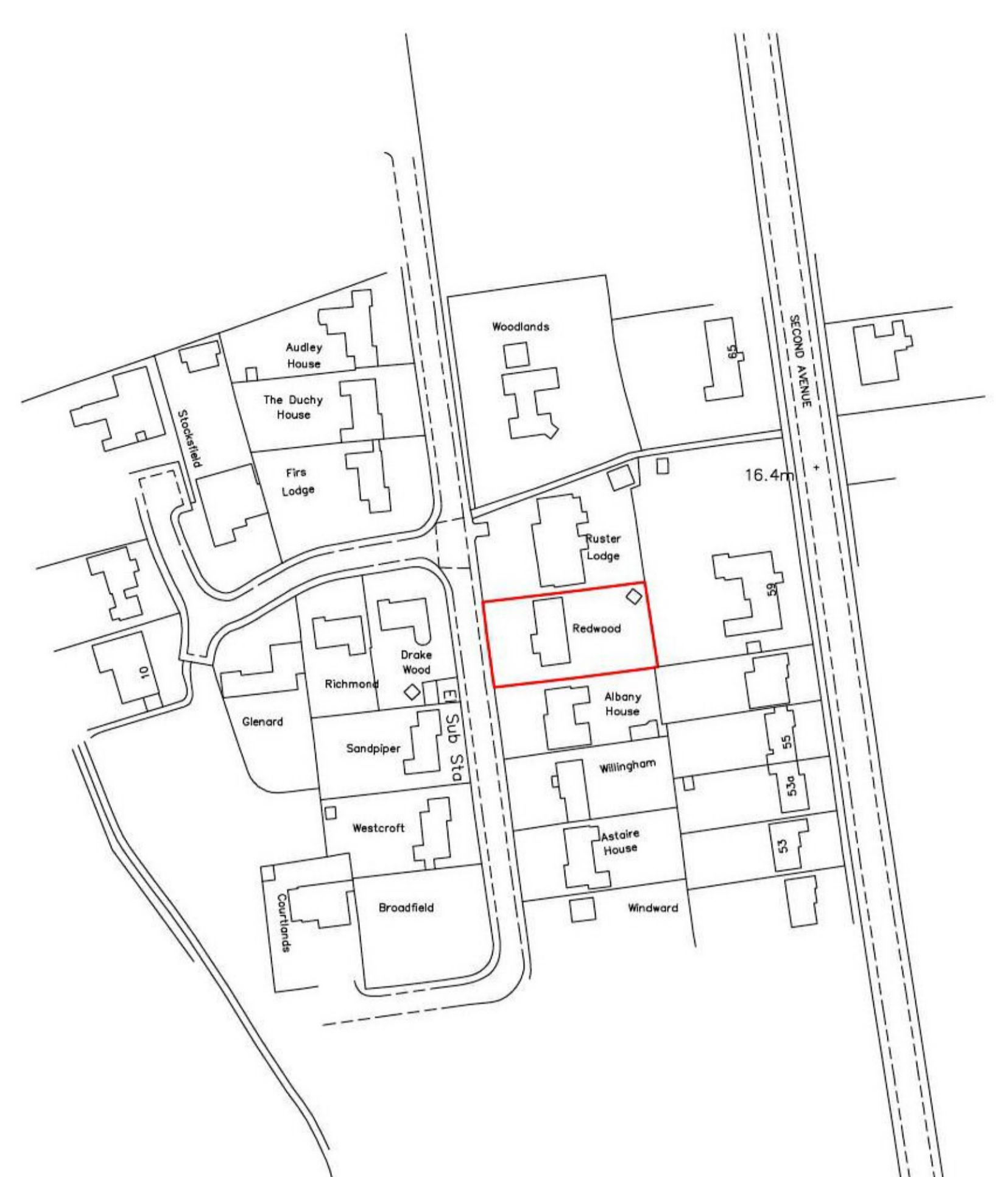
Existing Location Plan