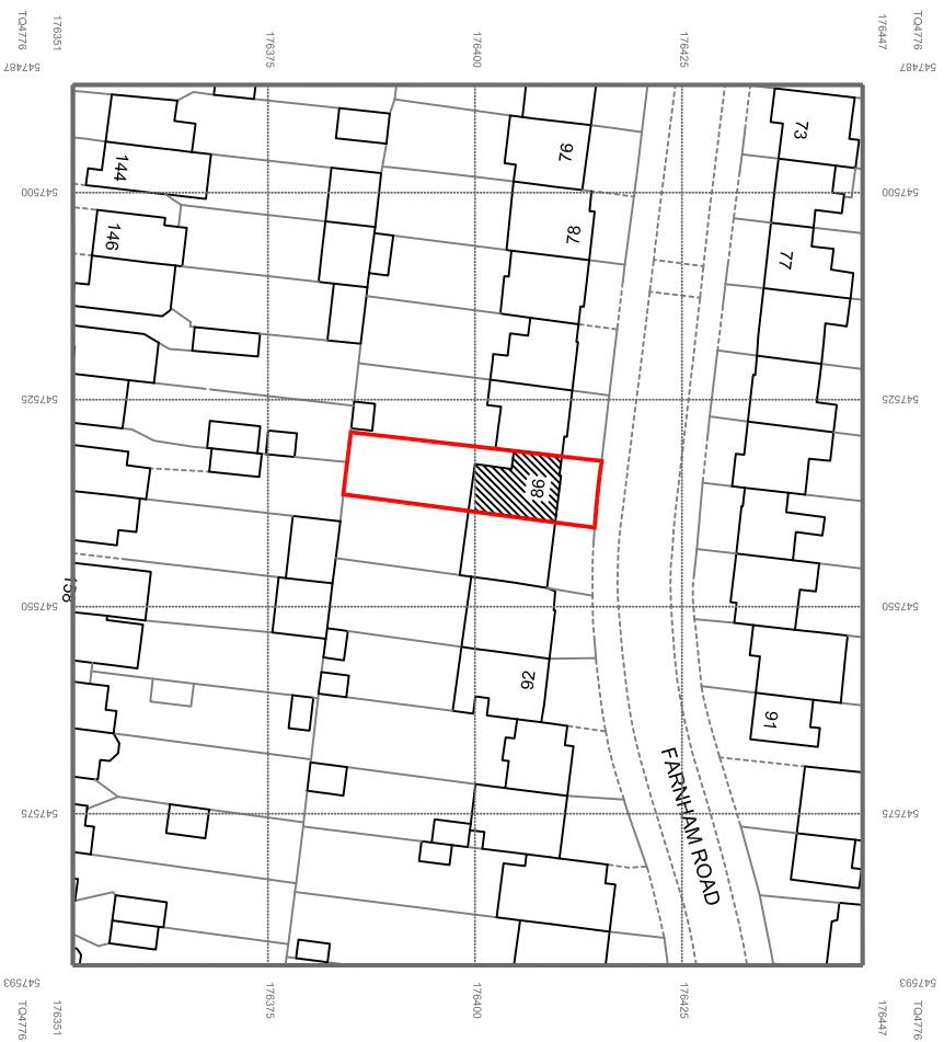
Location Plan Scale 1:1250@A3