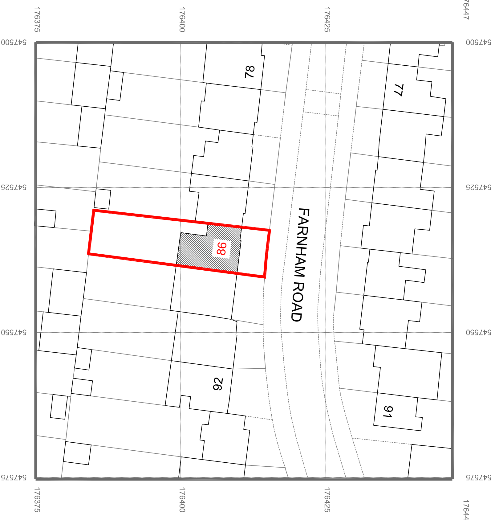
Site Plan Scale 1:500@A3

NOTES: ALL WORK TO BE CARRIED OUT IN ACCORDANCE WITH THE CURRENT BUILDING REGULATIONS. ALL DIMENSIONS / LEVELS TO BE CHECKED AND VERIFIED ON SITE BEFORE COMMENCEMENT OF WORK. THIS DRAWING IS TO BE USED IN CONJUNCTION WITH PROJECT WORKING DRAWINGS, SPECIFICATIONS, DETAILS AND STRUCTURE DRAWINGS. ALL MATERIAL USED IN THE PROPOSED EXTENSION SHOULD MATCH THE EXISTING BUILDING.