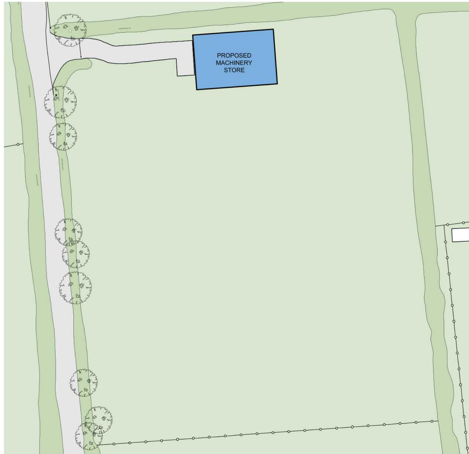
Proposed Block Plan Scale 1:500