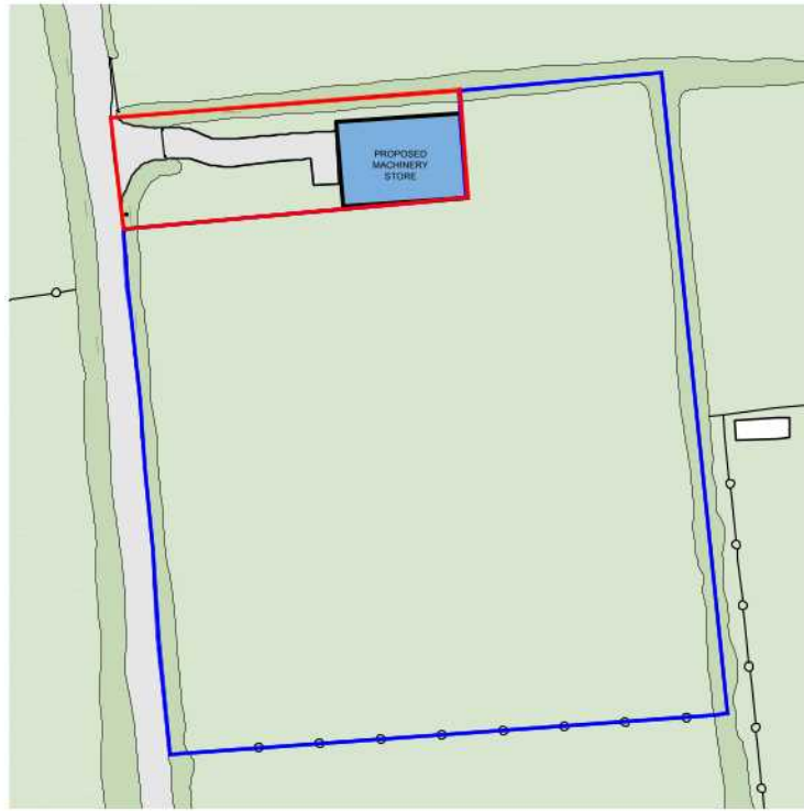
Proposed Location Plan Scale 1:1250

Note: ALL DIMENSIONS TO BE CHECKED ON SITE FOR ANY DISCREPANCIES TO BE NOTIFIED PRIOR TO COMMENCEMENT OF WORK.