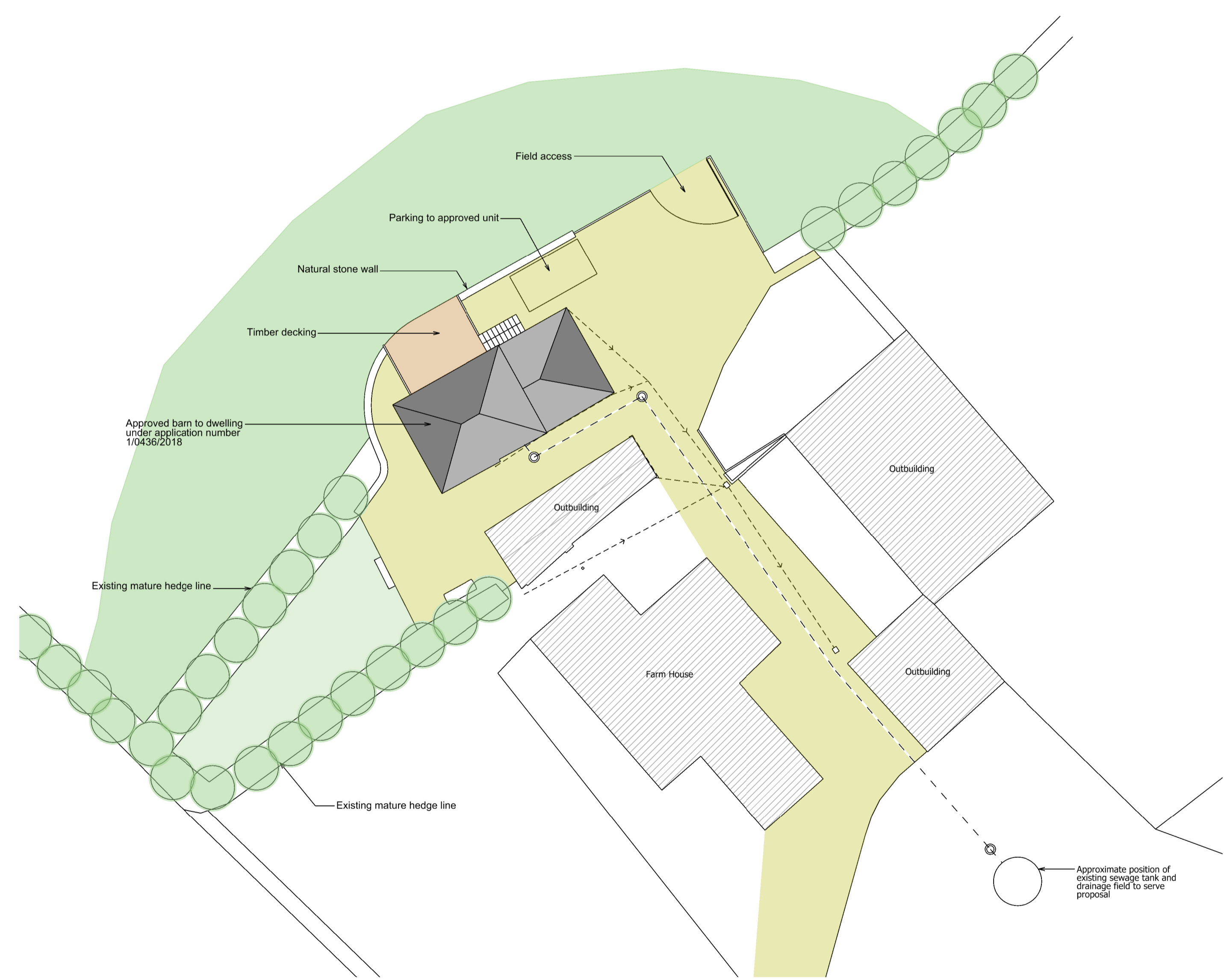
Site Plan 0m 10 20 1:200 at A1