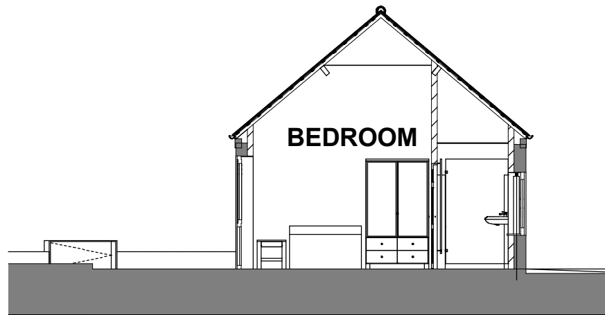
PROPOSED SECTION C 1:100