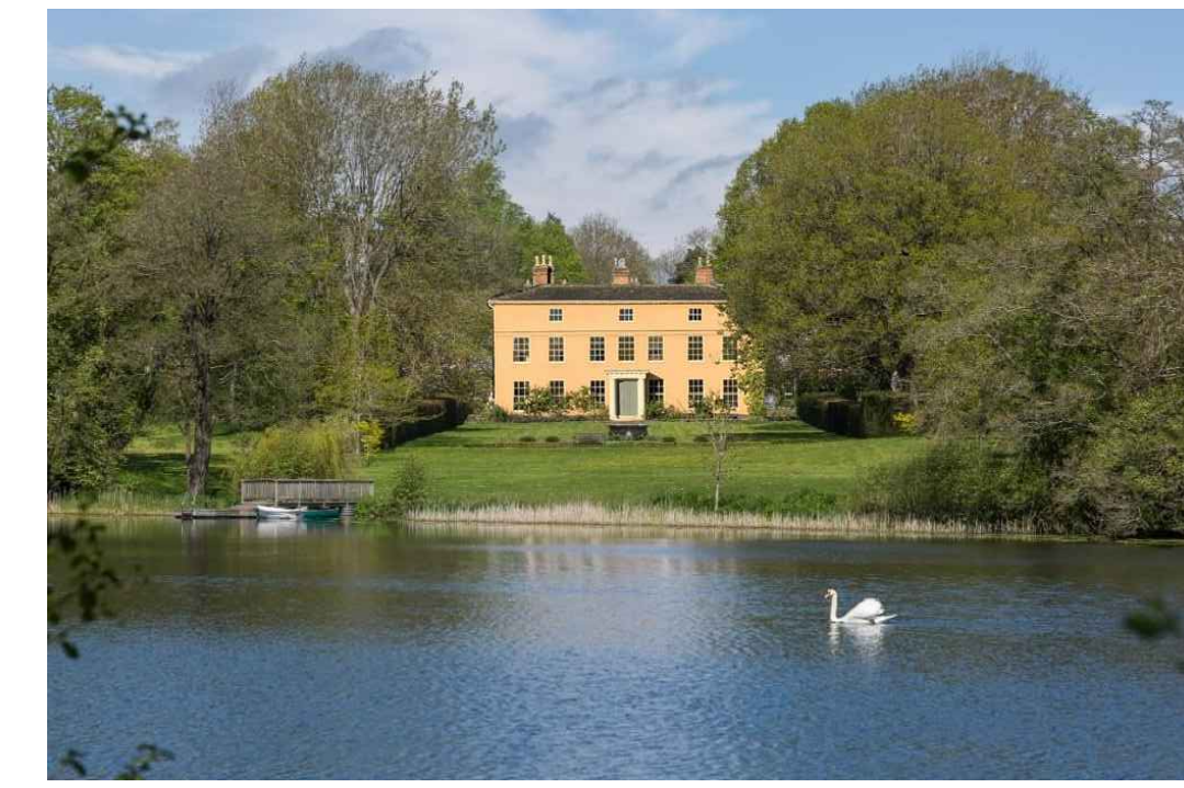
Indicative view of Buxhall Vale frontage with pond