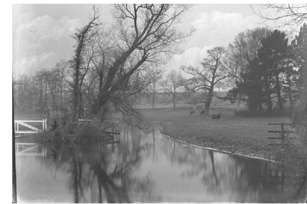
HISTORIC PRECEDENT Historic photo (1910) within the front parkland of Buxhall Vale.