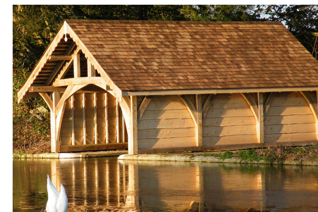
EXAMPLE OF BOAT HOUSE See drawing 5614/10A for details.

EXISTING TREES The proposals do not harm or require the removal of existing trees