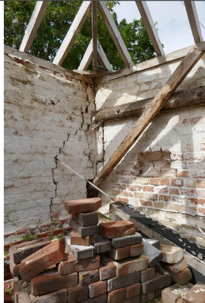
Example of crack to west elevation