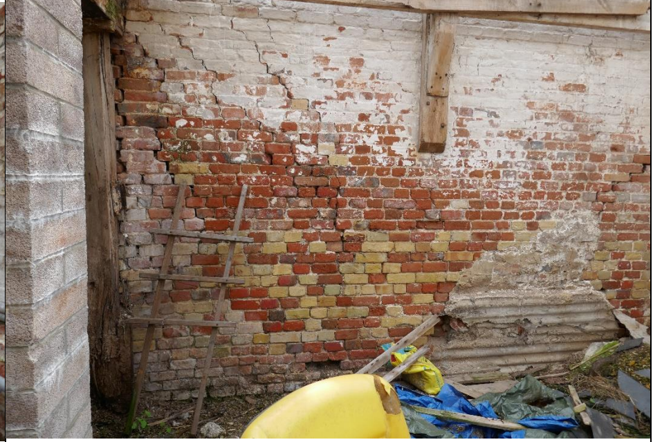
Example of cracking to partition wall