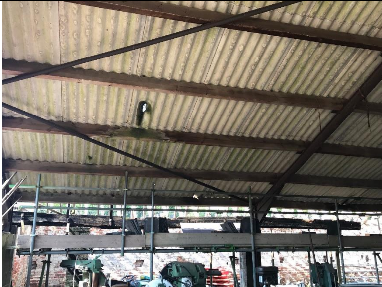
Example of damaged roof sheets