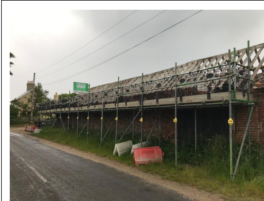
West elevation (facing north)