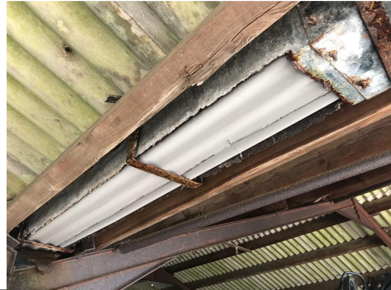
Example of corroded gutters