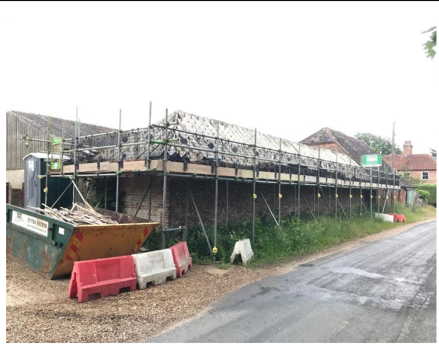
North & west elevations (facing south-east)