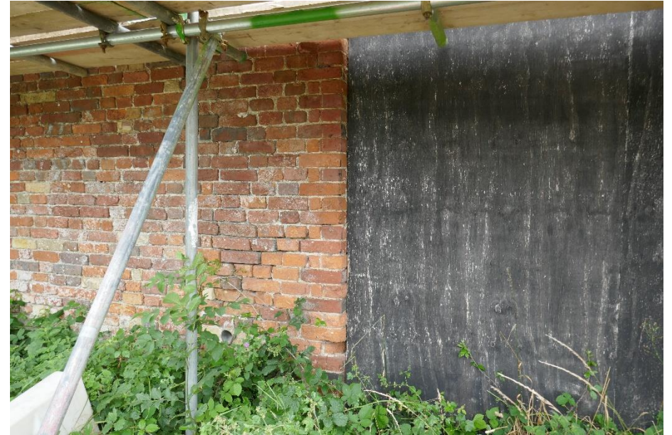
Example of localised area requiring repointing on west elevation