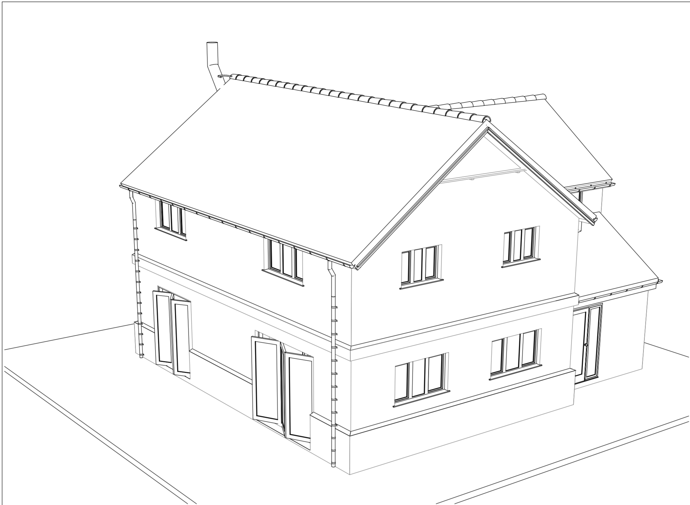
3D Front Perspective -Existing- Scale: 1:20