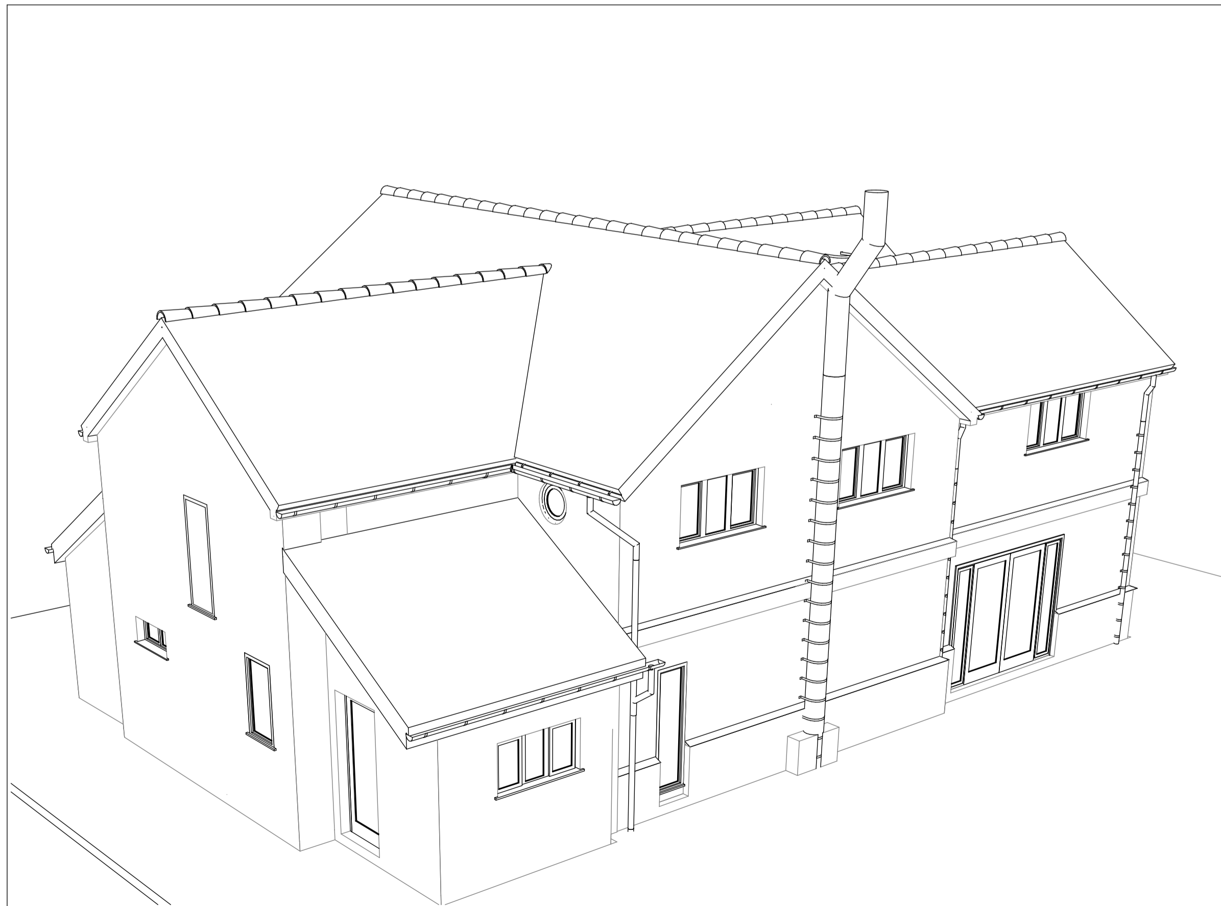
3D Side Elevation -Perspective -Proposed- Scale: 1:20