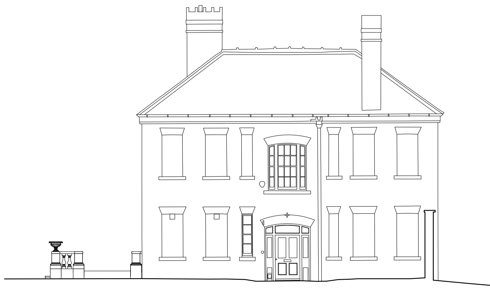
3 NORTH TERRACE WEST ELEVATION AS PROPOSED 5012 1:100 @ A1