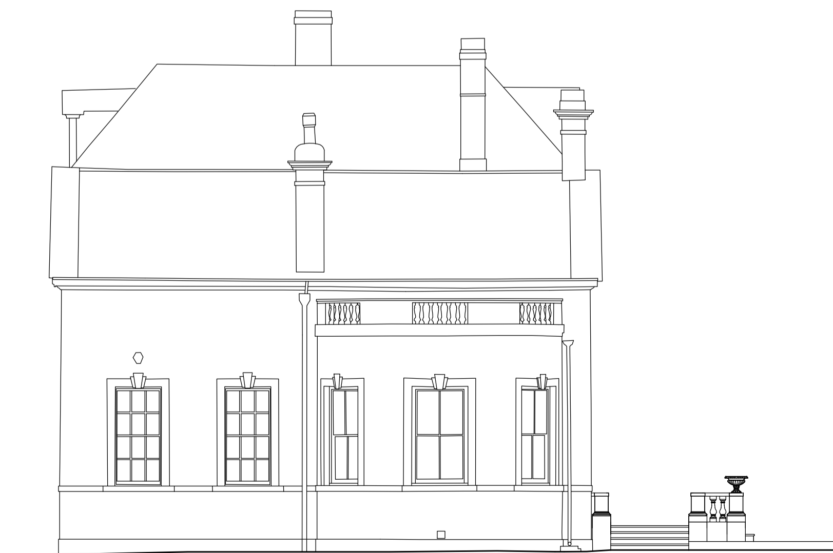
4 NORTH TERRACE EAST ELEVATION AS PROPOSED 5012 1:100 @ A1