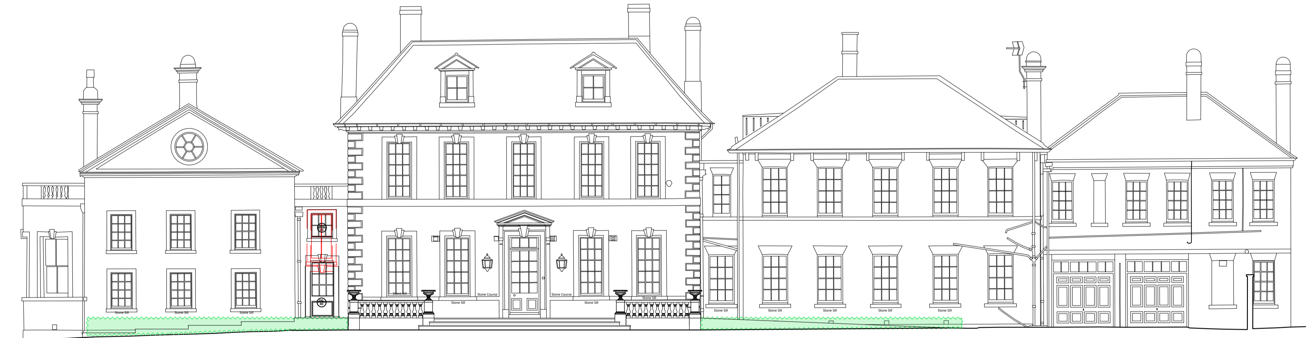
2 NORTH TERRACE NORTH ELEVATION AS PROPOSED 5012 1:100 @ A1