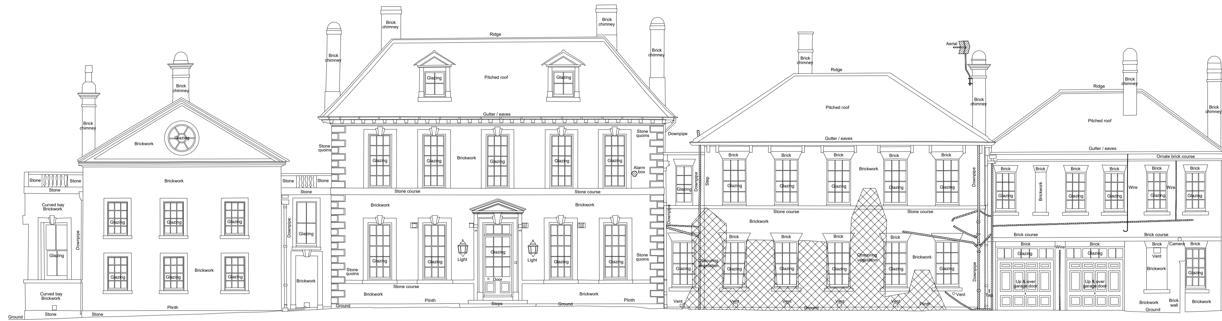
1 EXISTING NORTH ELEVATION 1001 1:100

Notes: Drawings are based on survey data and may not accurately represent what is physically present. Do not scale from this drawing. All dimensions are to be verified on site before proceeding with the work. All dimensions are in millimeters unless noted otherwise. Purcell shall be notified in writing of any discrepancies.