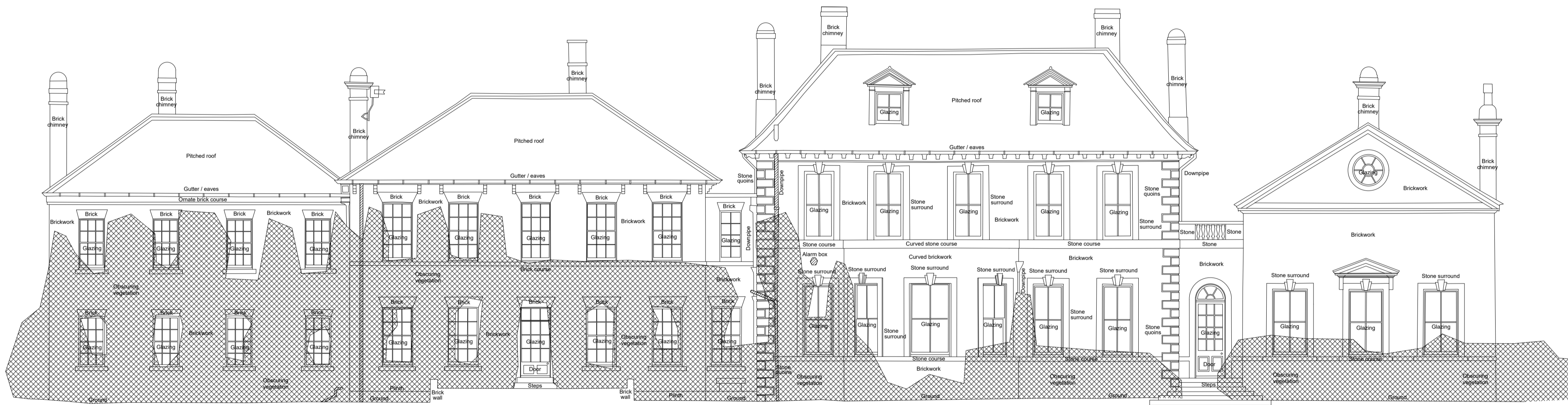
2 EXISTING SOUTH ELEVATION 1001 1:100