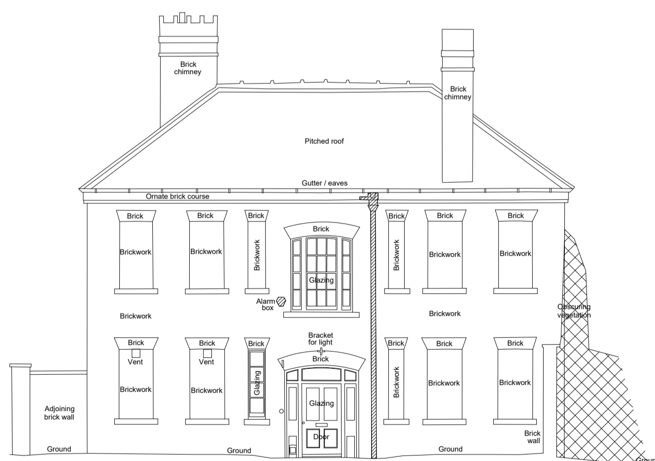
3 EXISTING WEST ELEVATION 1001 1:100