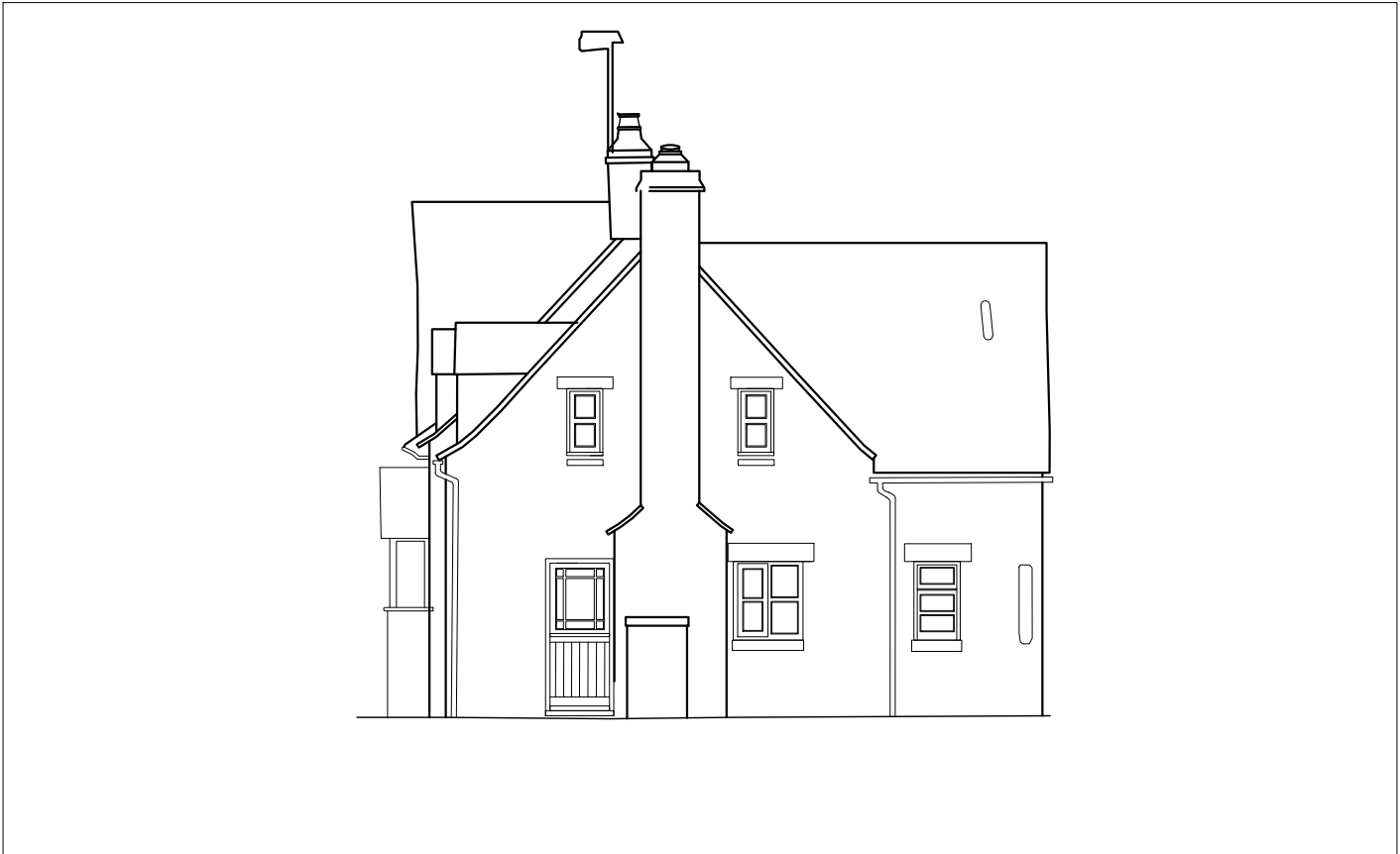
04 Existing North East Elevation