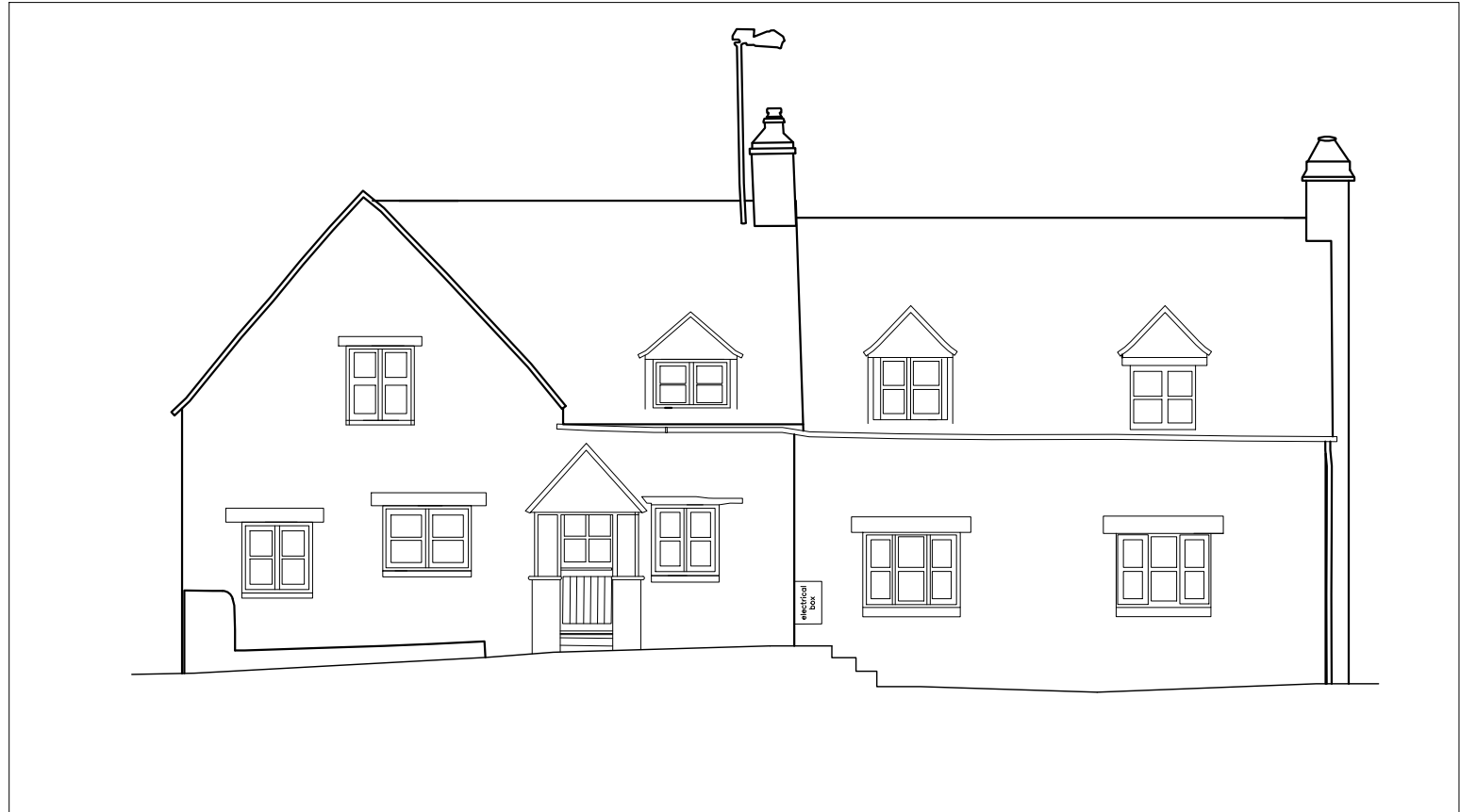
02 Existing South East Elevation