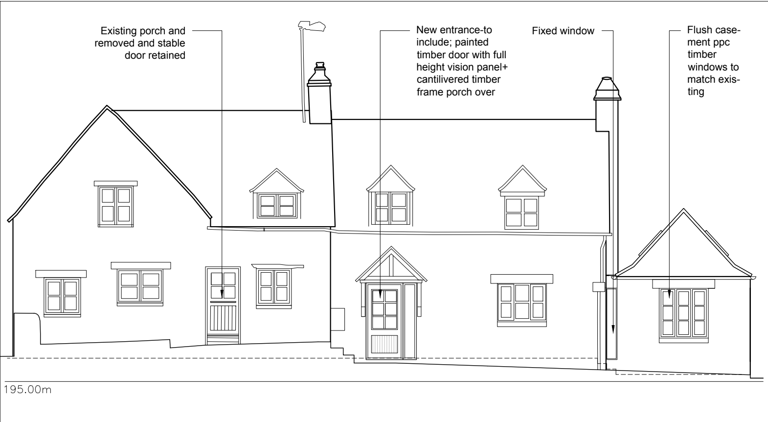
02 Proposed South East Elevation