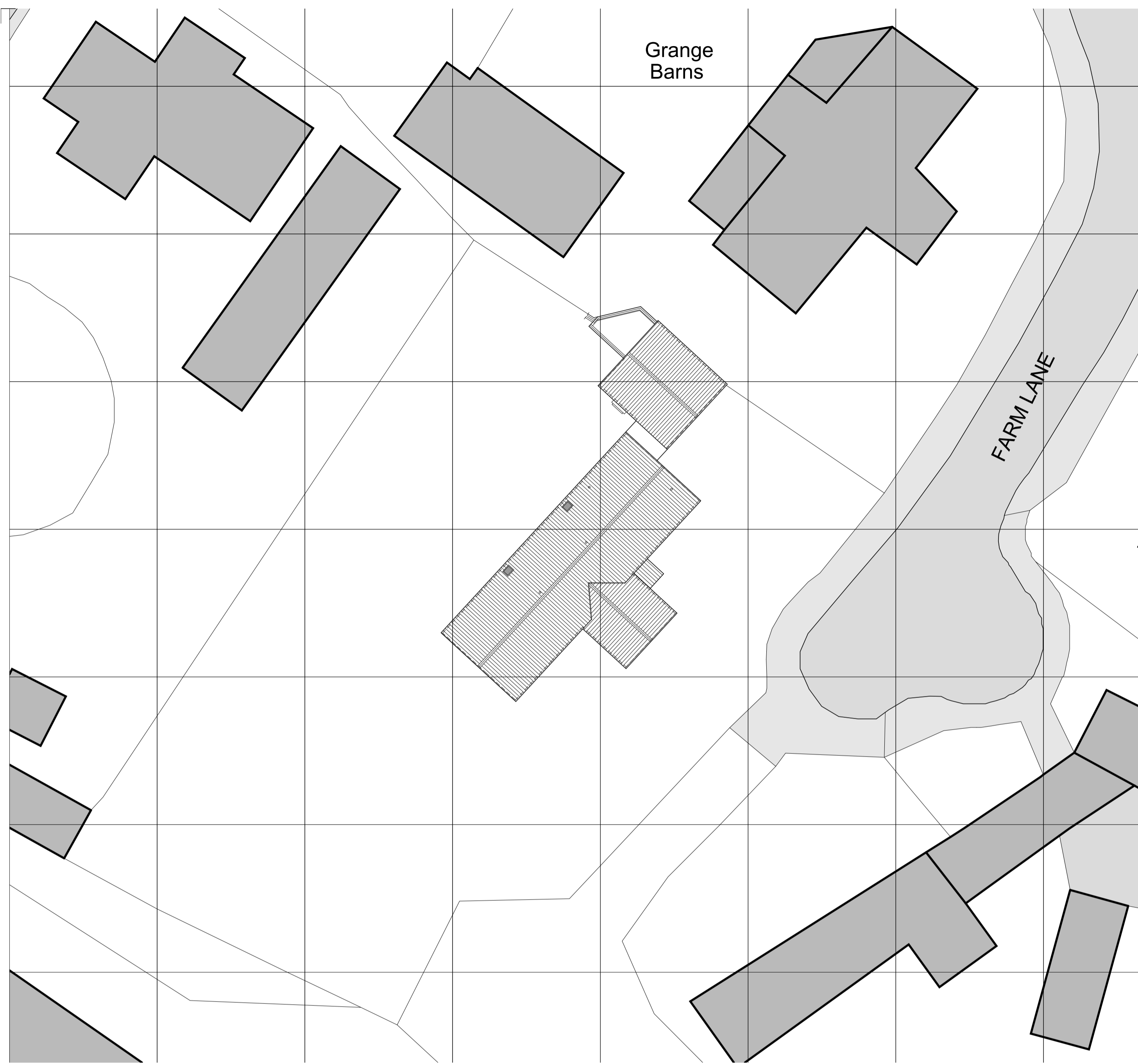
A Existing Block Plan/ Roof Plan 1:200