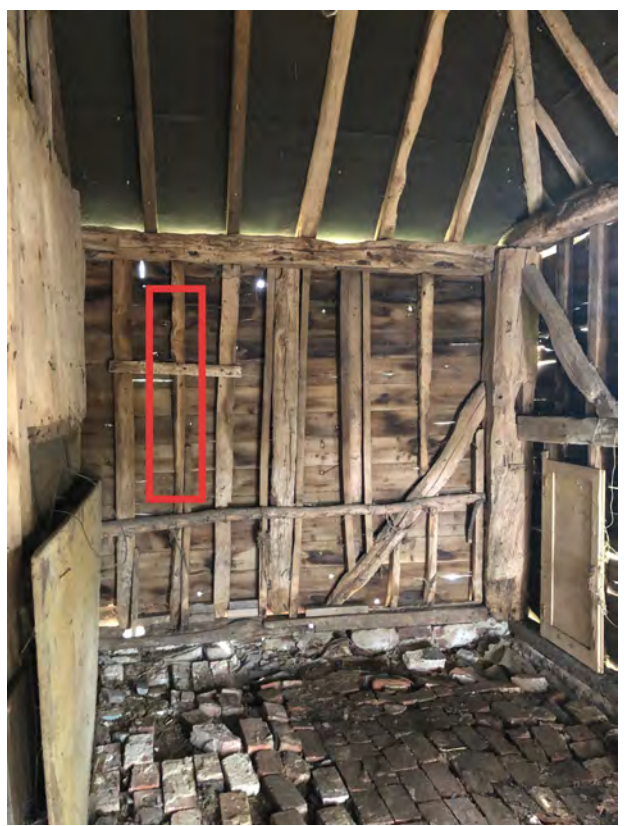
Barn interior – south elevation red box indicates area of new window