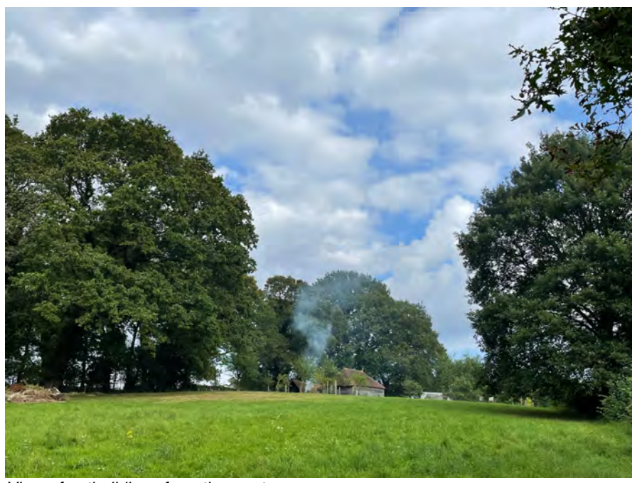
View of outbuildings from the west