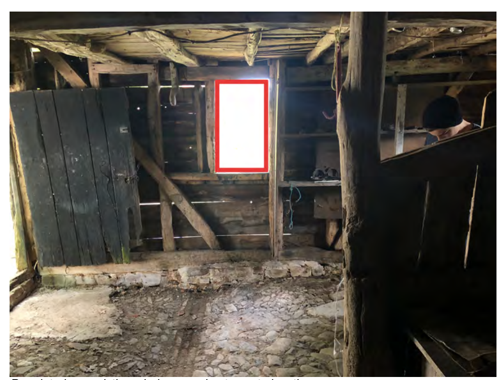
Barn interior – existing window opening to east elevation red box indicates area of new window in existing opening