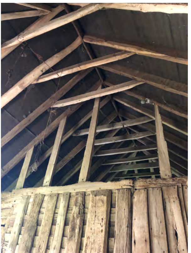
Barn interior - roof structure