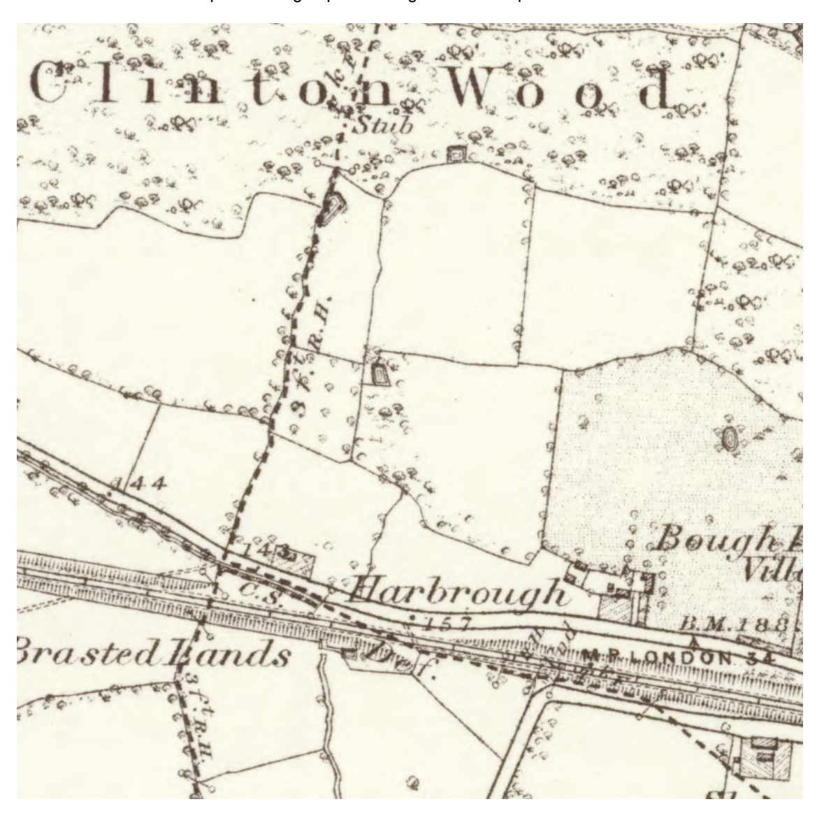
Ordnance Survey map 1872-3

Thirkell's Barn which was part of this group of buildings is now in separate residential use.