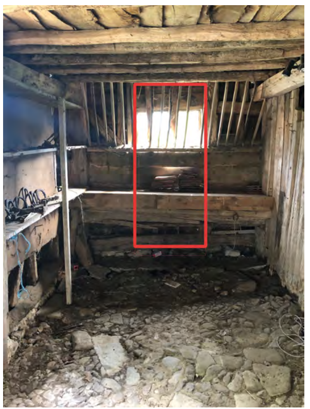
Barn interior – existing window opening to south elevation red box indicates area of new opening to the proposed glazed link