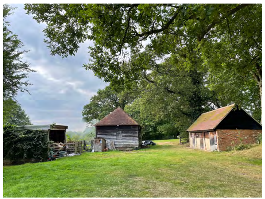
View of east end of barn, stables and woodshed from the farmhouse