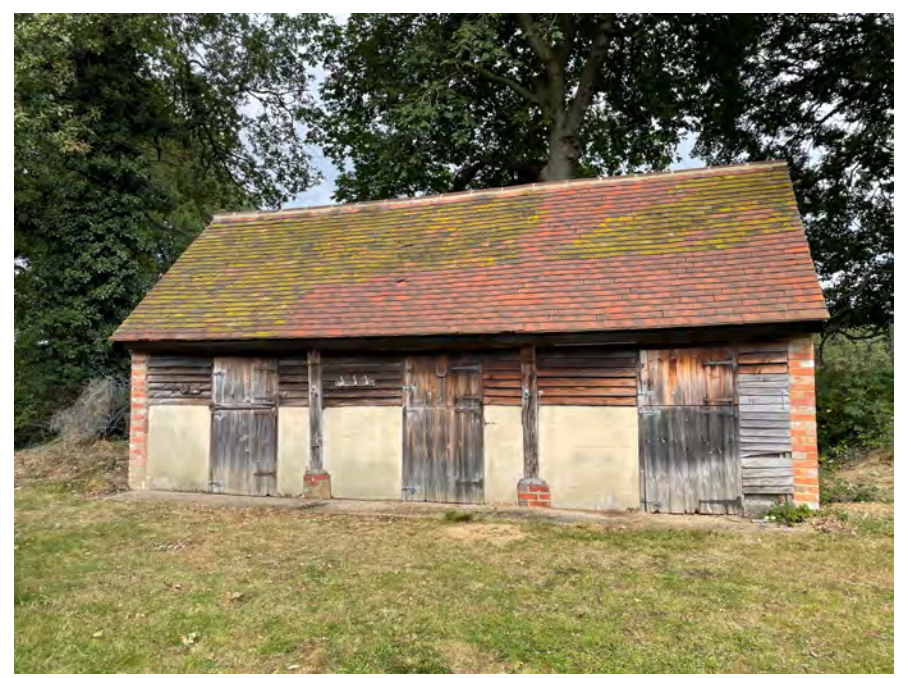
View of stables