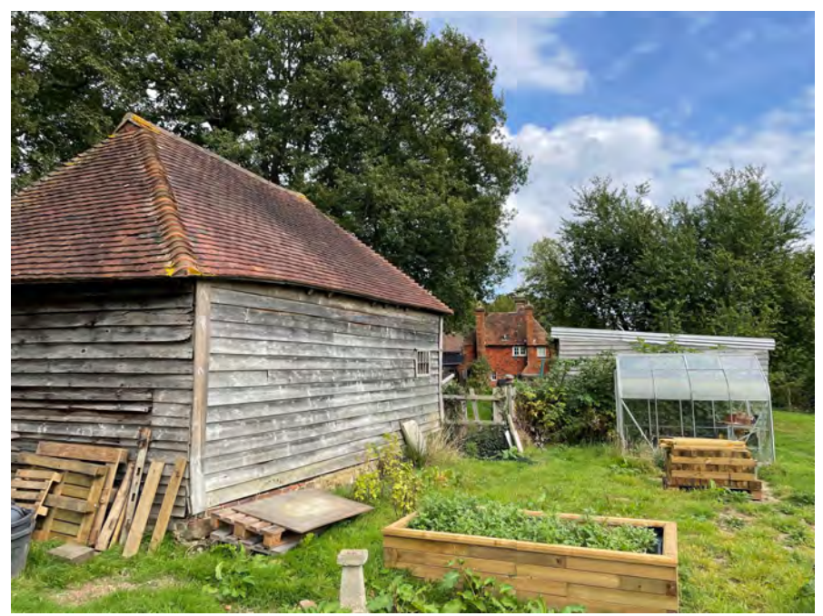
View of south west corner of barn and woodshed