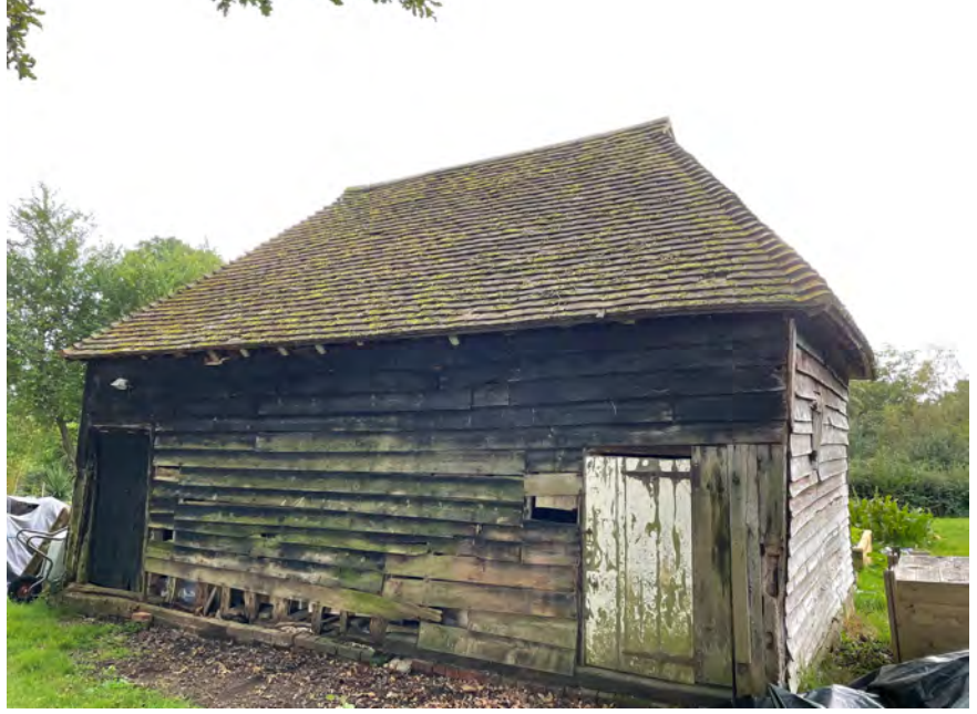
North elevation of the barn