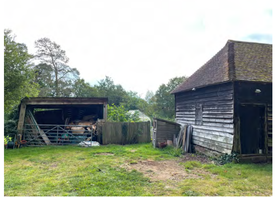
View of east end of barn and woodshed