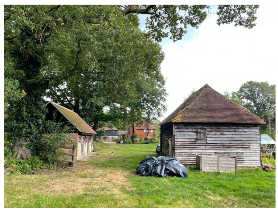
View of west end of barn and stables

The special interest of the buildings to the west of the farmhouse (barn and stables) lie in their group value and relationship with the grade II listed dwelling, illustrative of a multi dispersed farmstead and retain some historic features