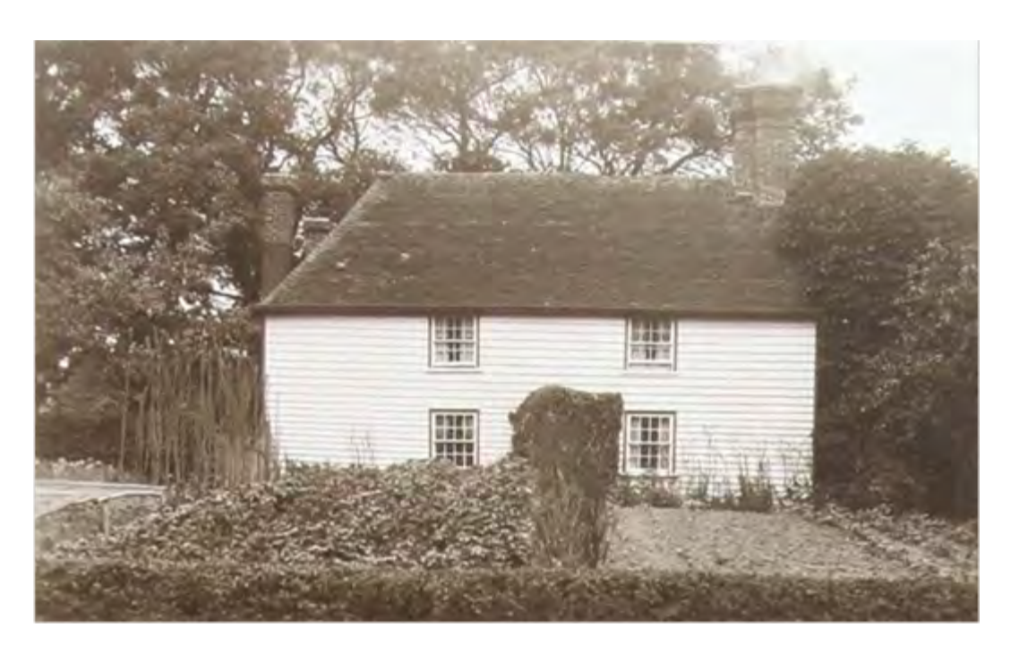
Undated (pre-1944) photograph of Harborough Farm

"18th Century weather boarded elevation concealing 16th Century or earlier timber framed building. 2 storeys, 2 windows, wide proportions. High pitched tiled roof, hipped at left, with compound ridge stack. On right return roughly coursed rubble masonry of chimney base visible below weatherboarding. Sash windows with glazing bars. Plank Door. 17th Century lean-to Sweeping low at back. Inside much exposed timber.