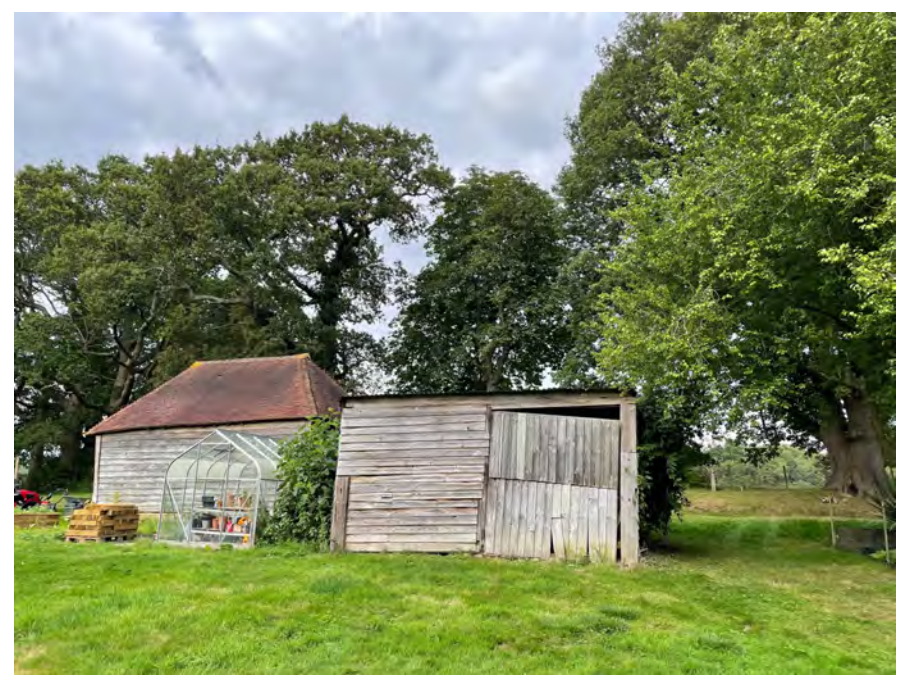
View of south end of barn and woodshed