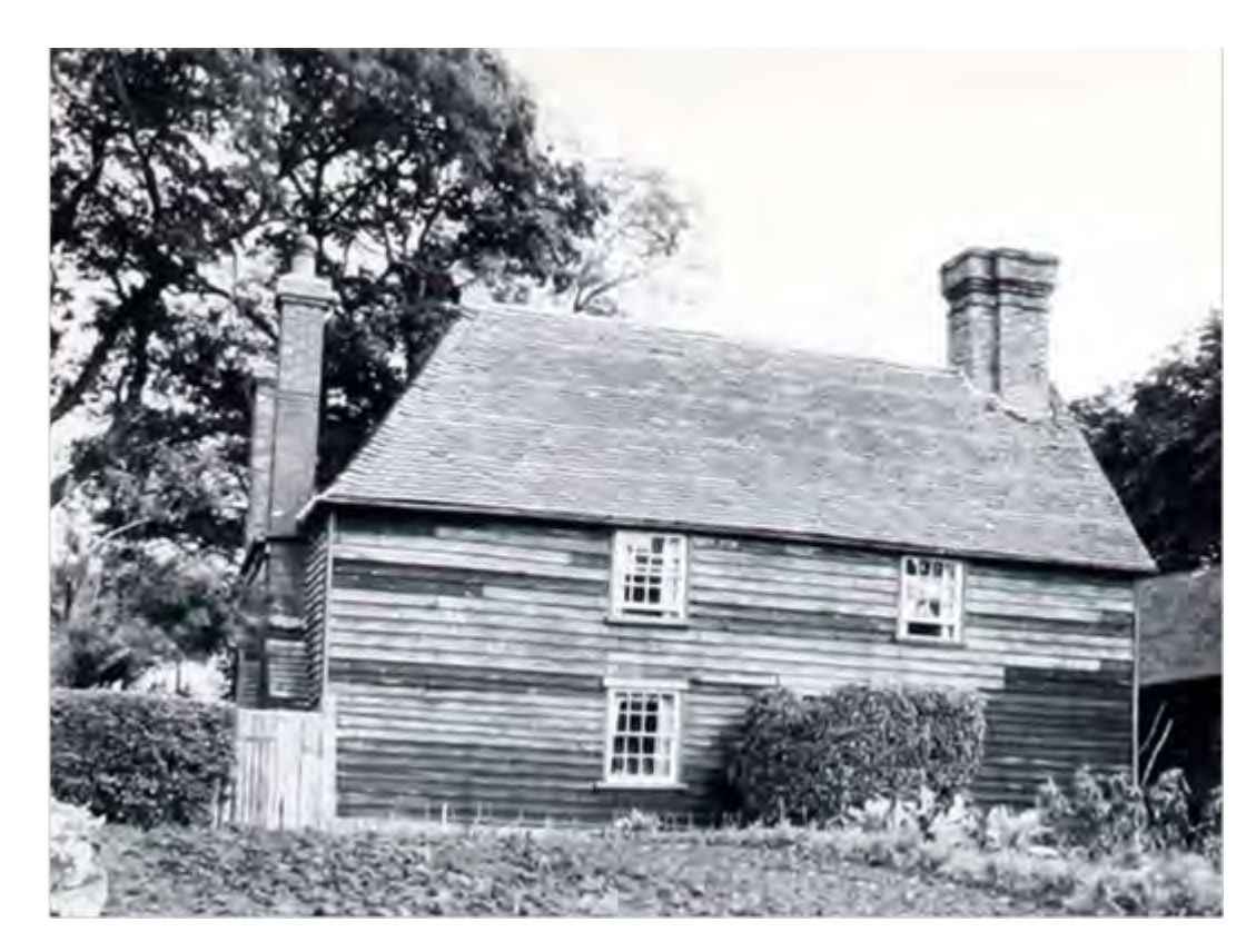
1957 photograph of Harborough Farm

Following the grant of planning and listed building consent February 1976, a large number of alterations to the building were approved and the resulting construction work very much determined the appearance of the building to this day.