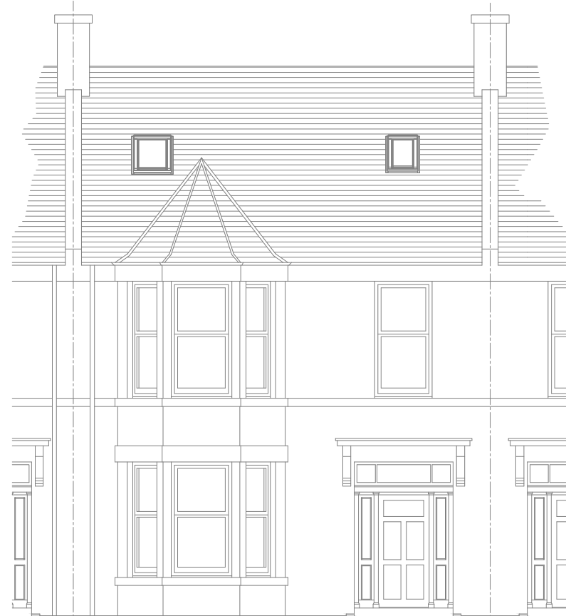
Existing North Elevation Scale 1:100