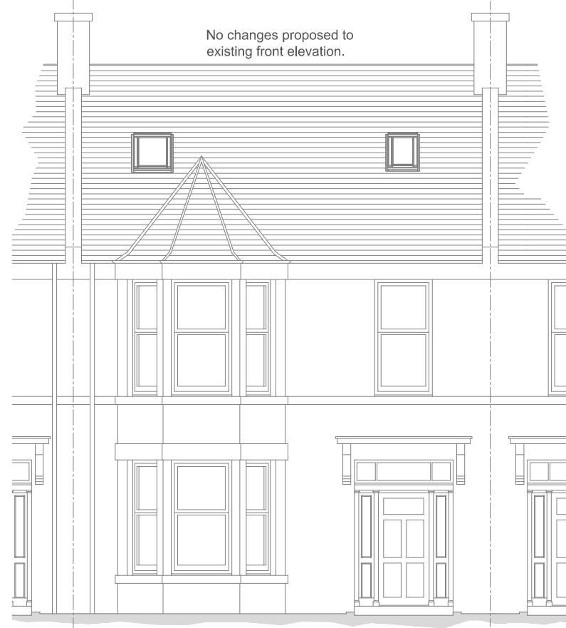
Proposed North Elevation Scale 1:100