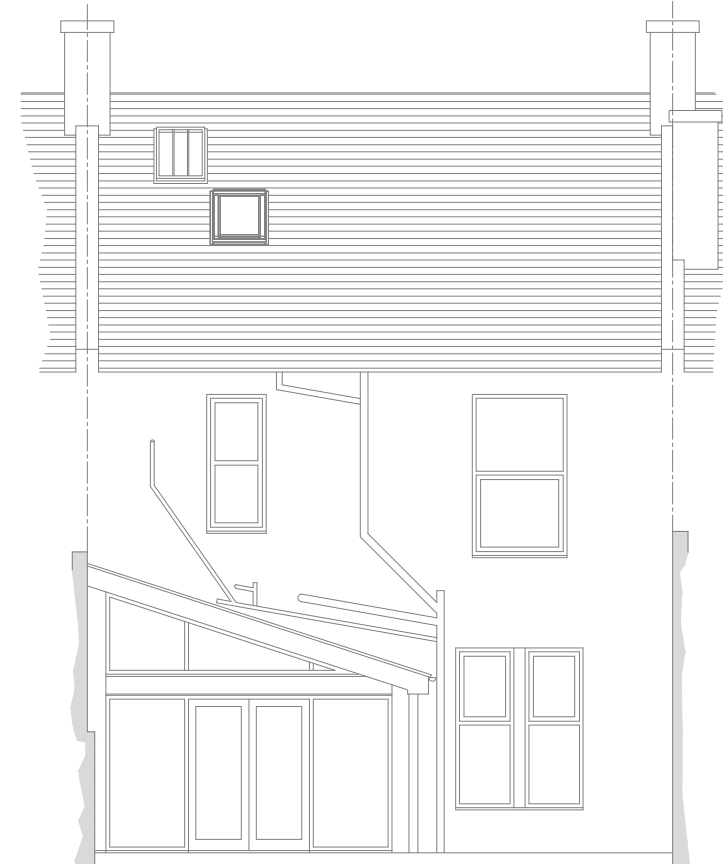
Existing South Elevation Scale 1:100