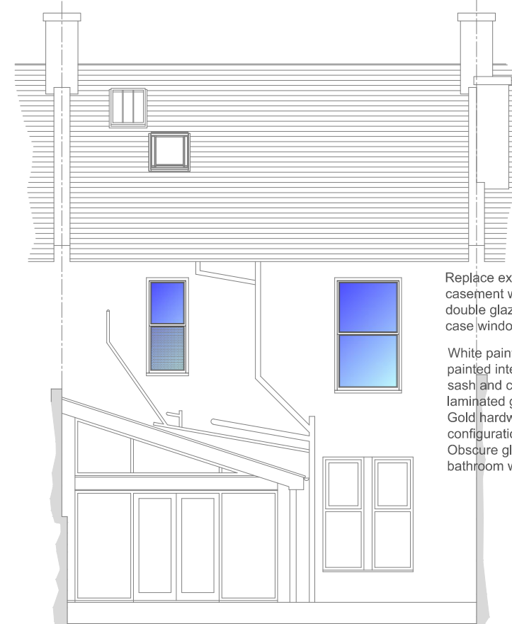
Proposed South Elevation Scale 1:100