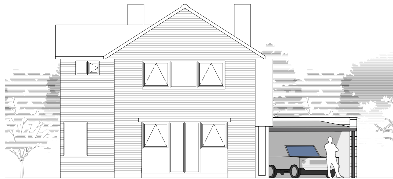
03 Proposed south elevation