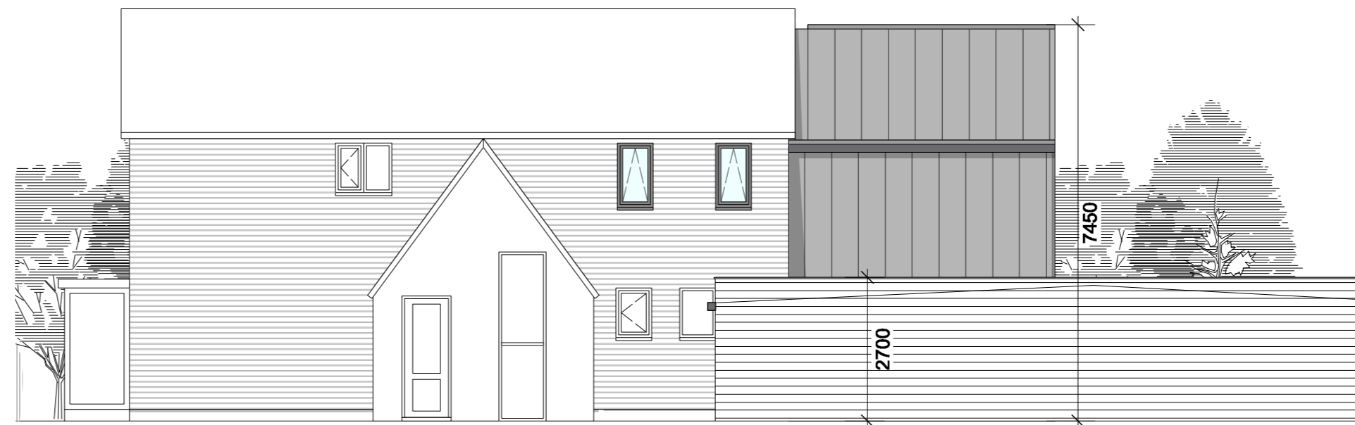
04 Proposed east elevation