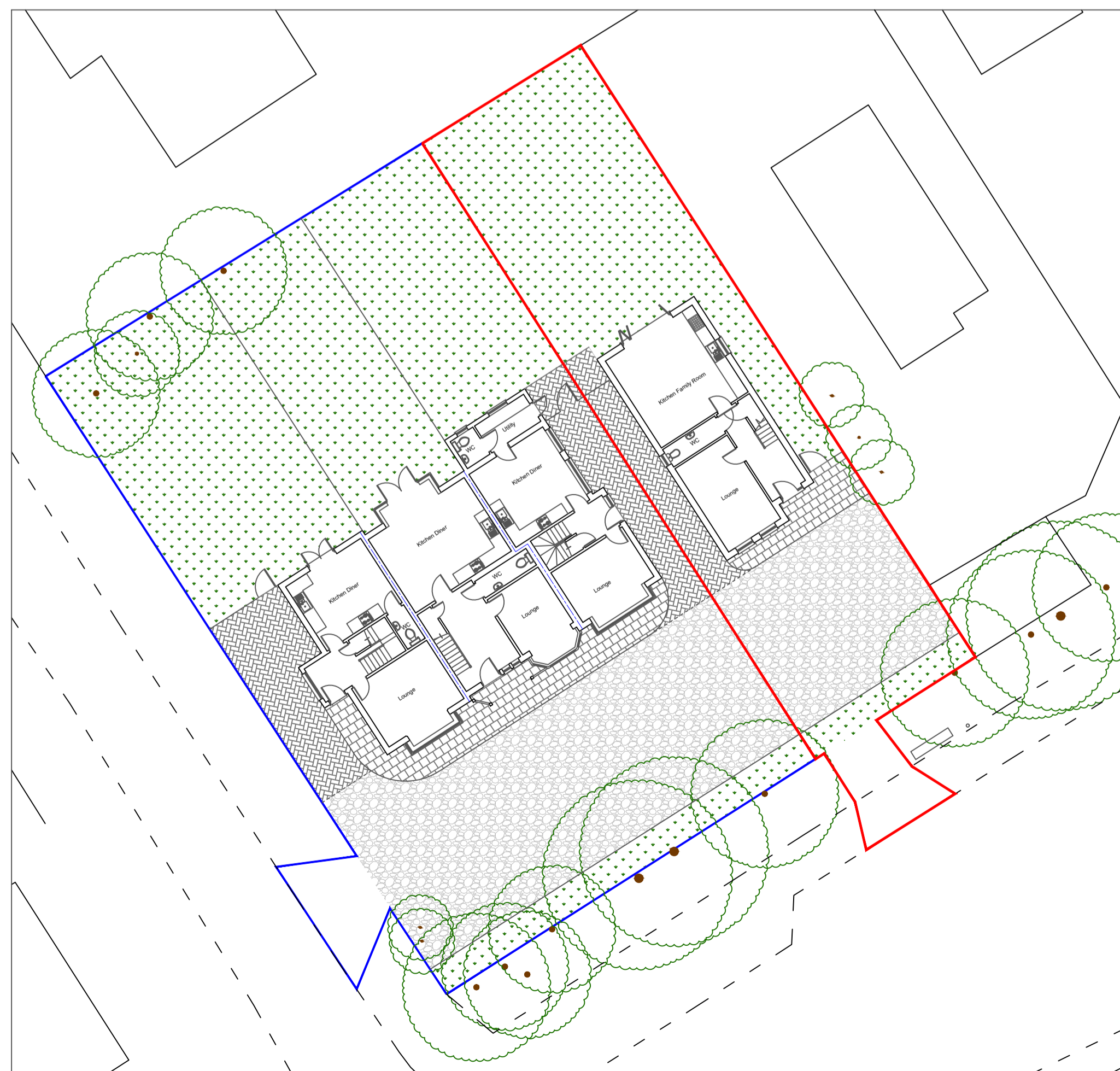
Existing Site Plan 1:200