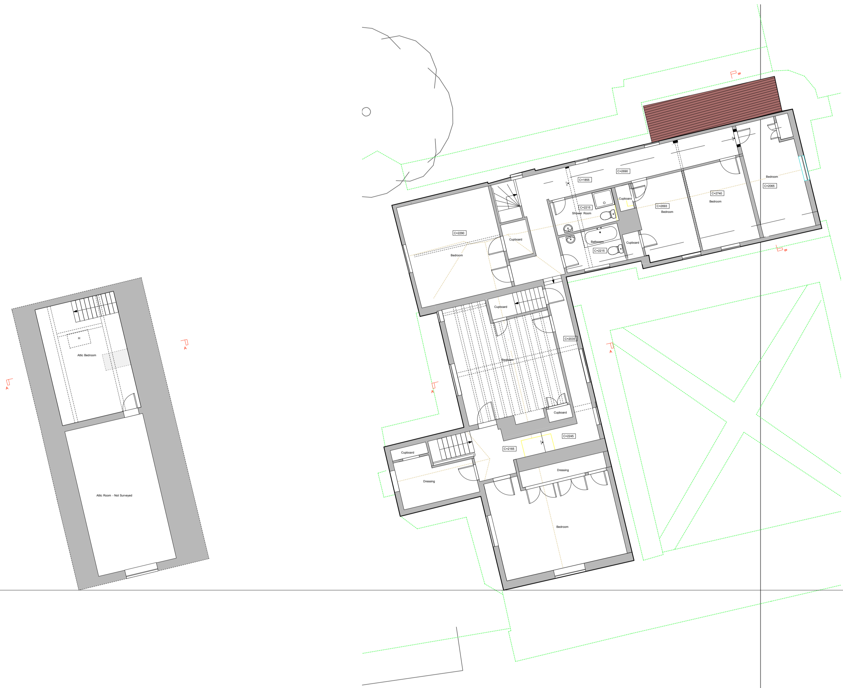
SECOND FLOOR PLAN (ATTIC)