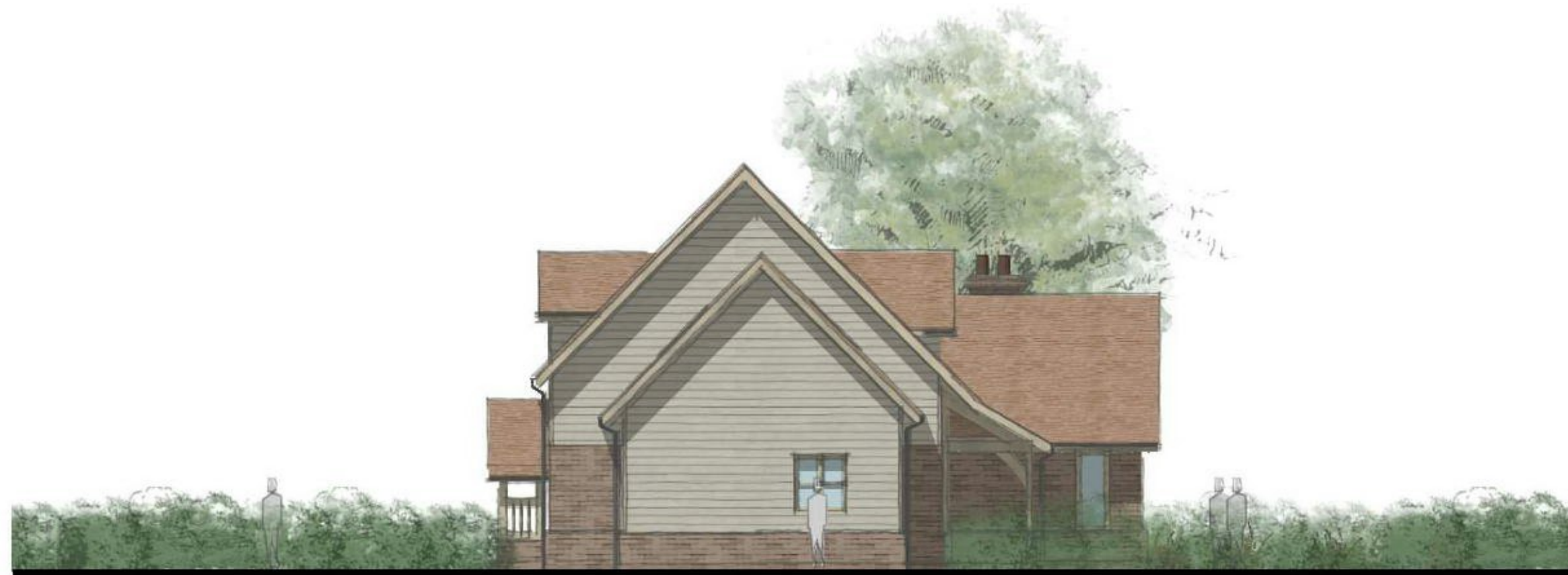
SIDE R ELEVATION