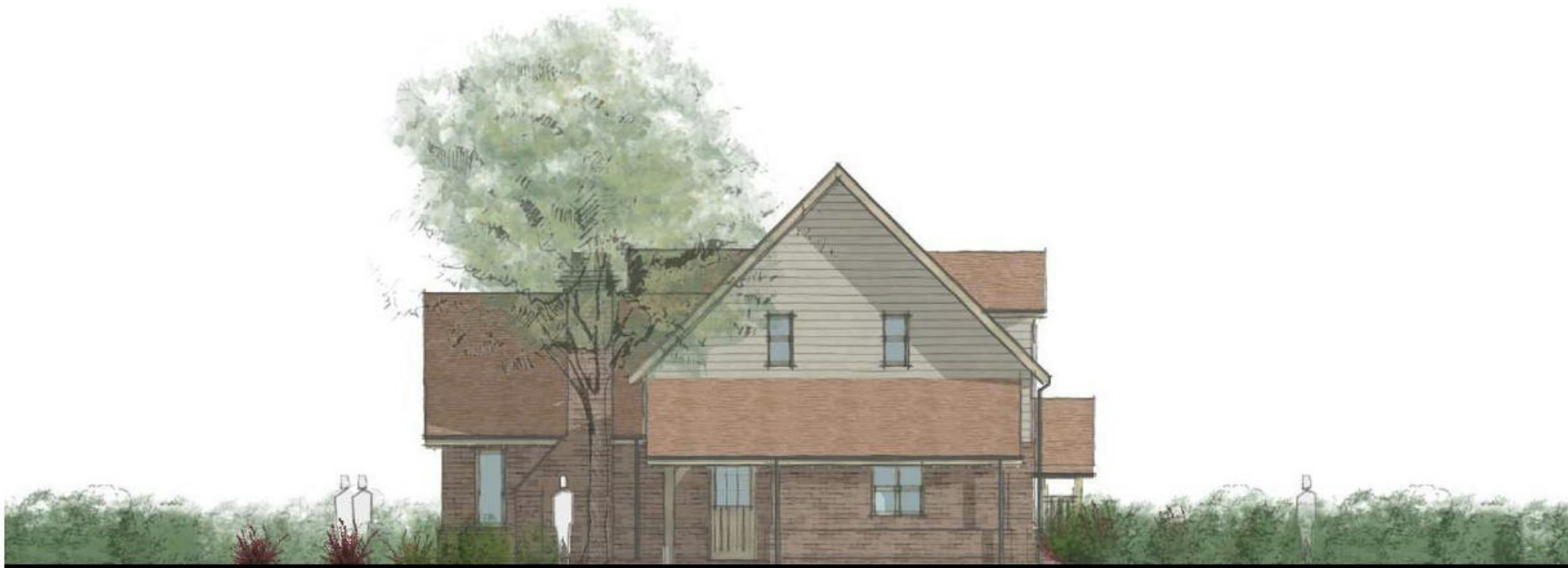
SIDE L ELEVATION