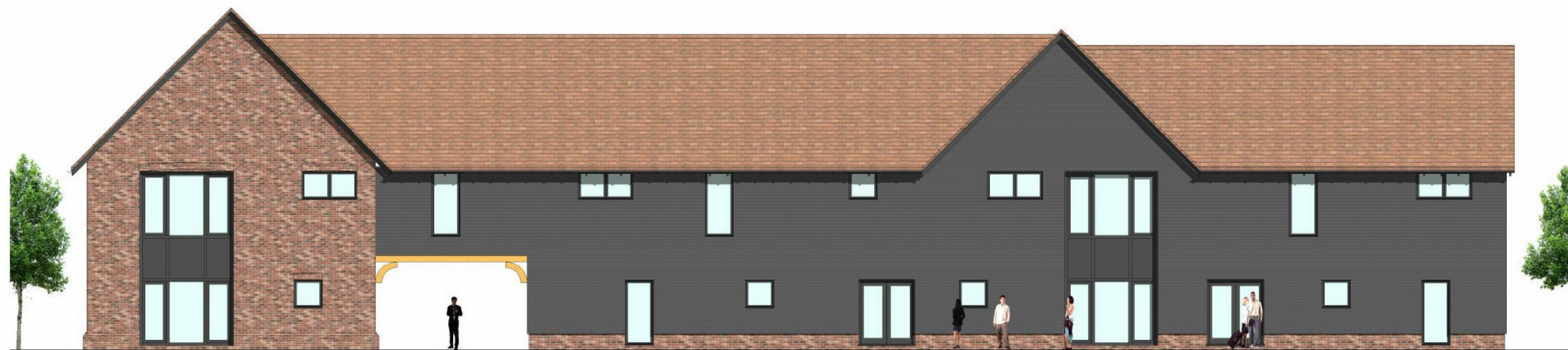
PROPOSED EAST ELEVATION - 1 : 100