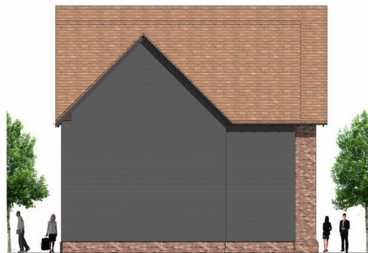
PROPOSED NORTH ELEVATION - 1 : 100