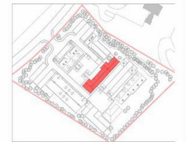
Key Plan - Plot 3 - E - 1 : 2500

DO NOT SCALE FROM THIS DRAWING. WORK TO FIGURED DIMENSIONS ONLY. THIS DRAWING IS THE COPYRIGHT OF STANLEY BRAGG ARCHITECTS LTD AND SHOULD NOT BE REPRODUCED WITHOUT THEIR EXPRESS PERMISSION