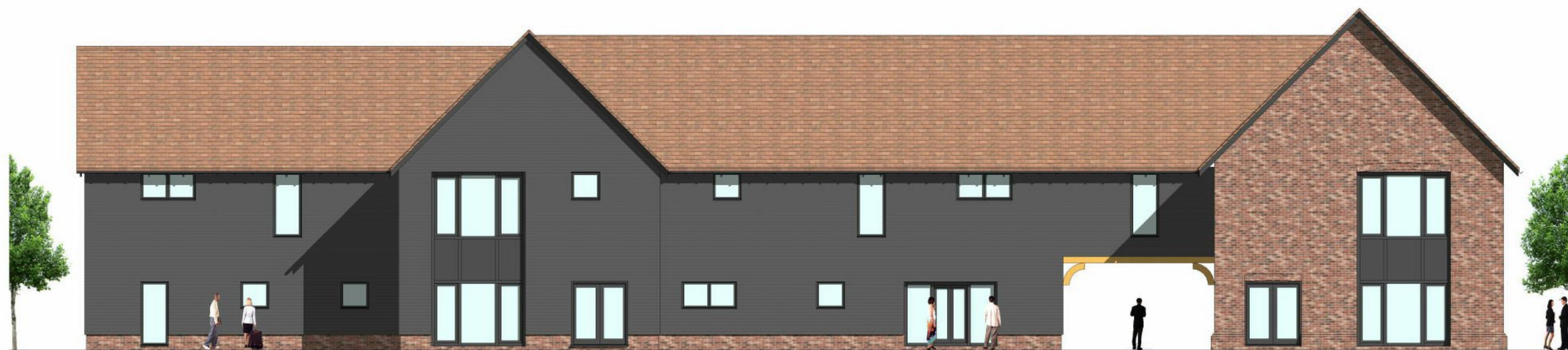
PROPOSED WEST ELEVATION - 1 : 100