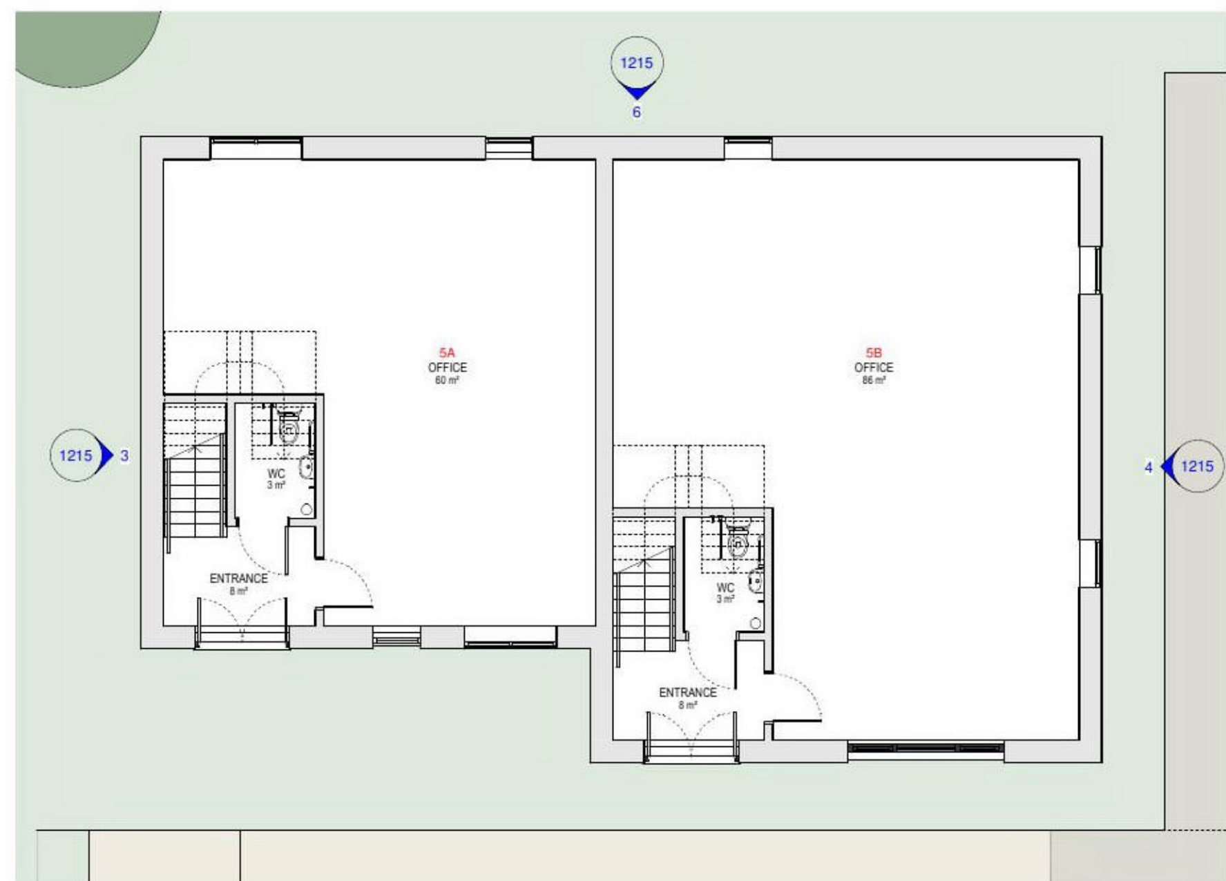
PROPOSED GROUND FLOOR PLAN - 1 : 100