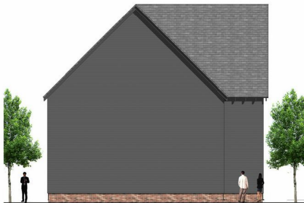
PROPOSED NORTH ELEVATION - 1 : 100