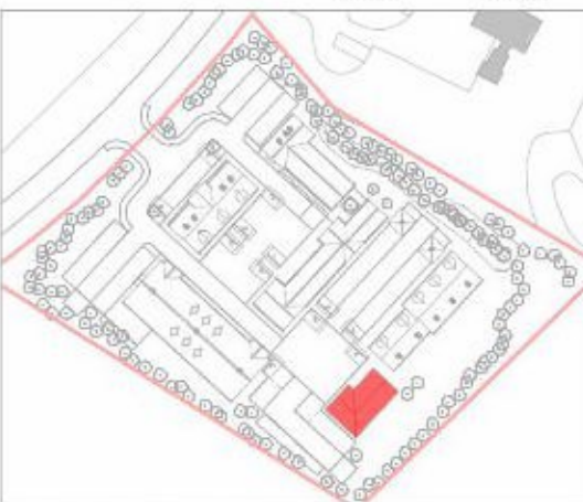
Key Plan - Plot 5 - 1 : 2500

Roof: Reconstituted slate / Red pan tiles