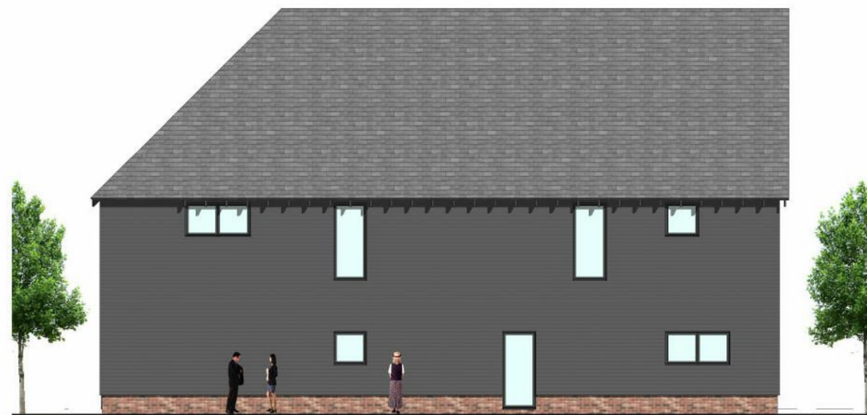
PROPOSED EAST ELEVATION - 1 : 100