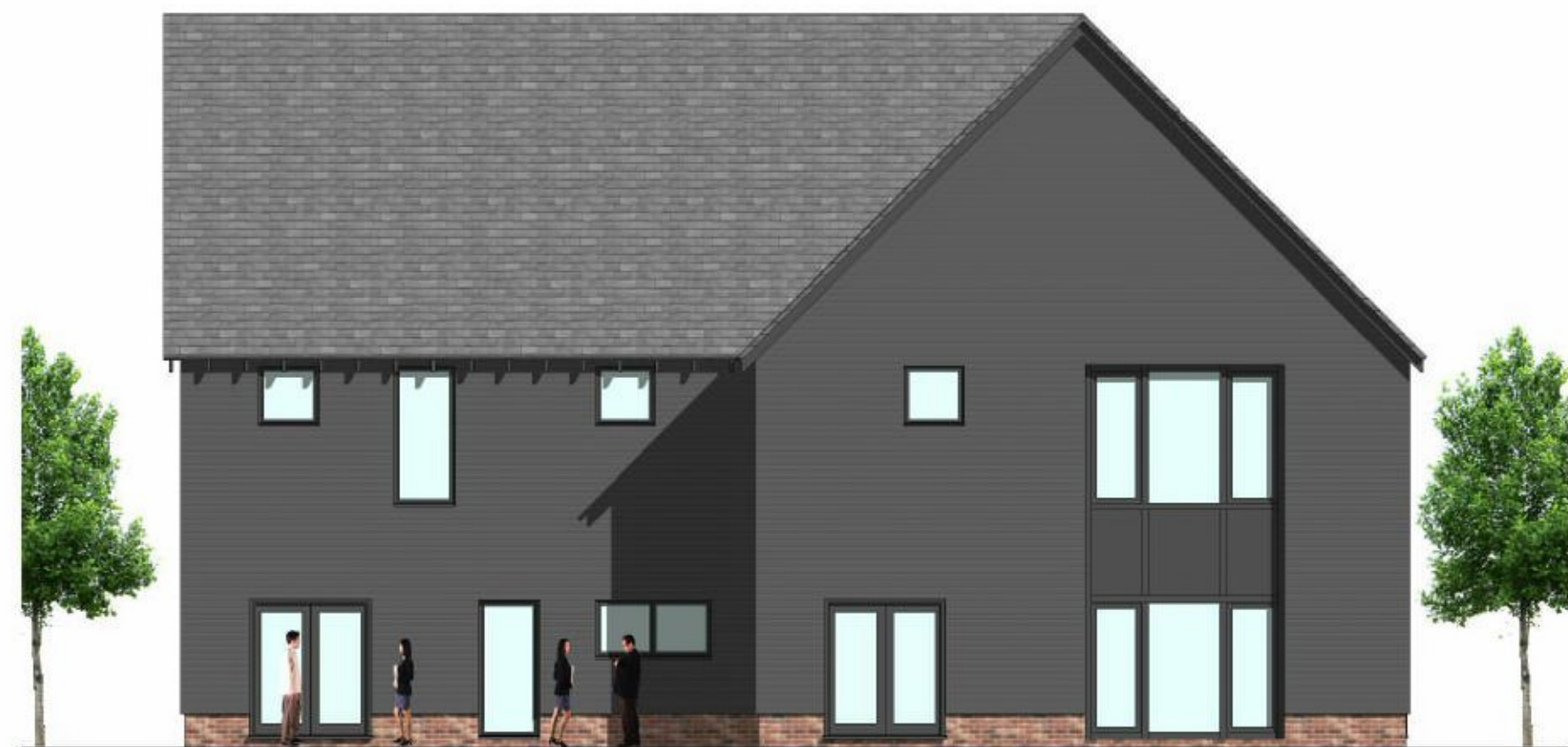
PROPOSED WEST ELEVATION - 1 : 100