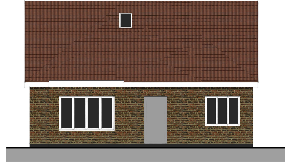
proposed front elevation scale 1:100