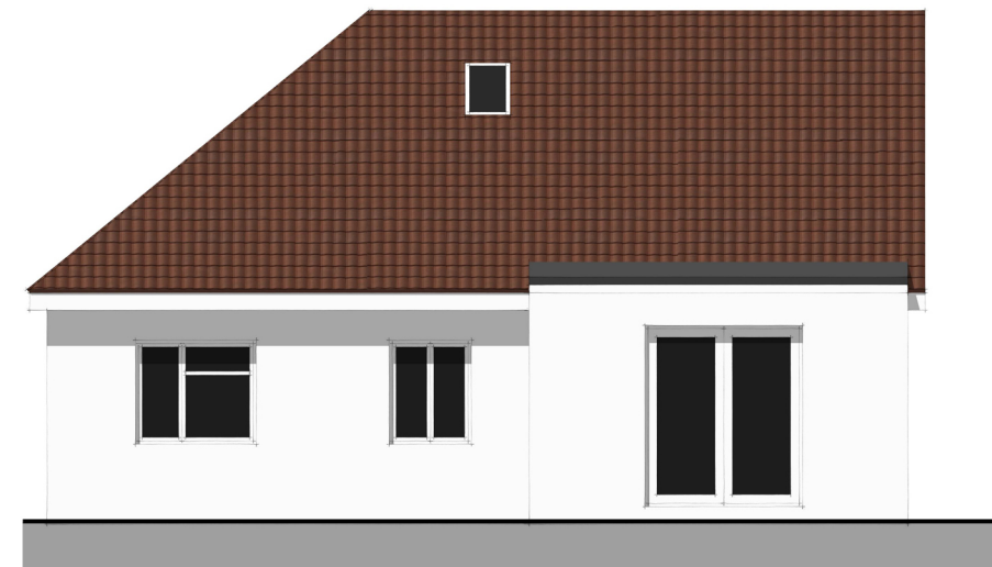
existing rear elevation scale 1:100