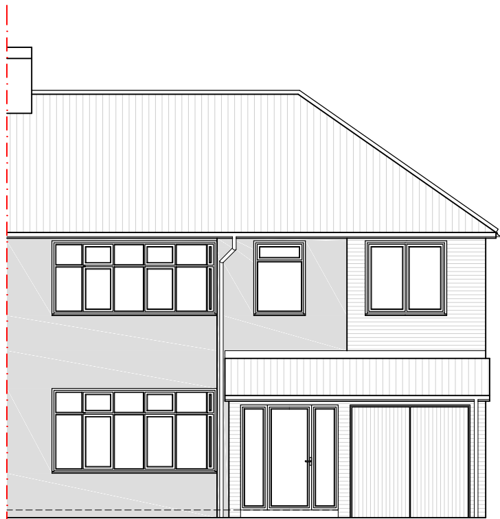
East Facing Elevation