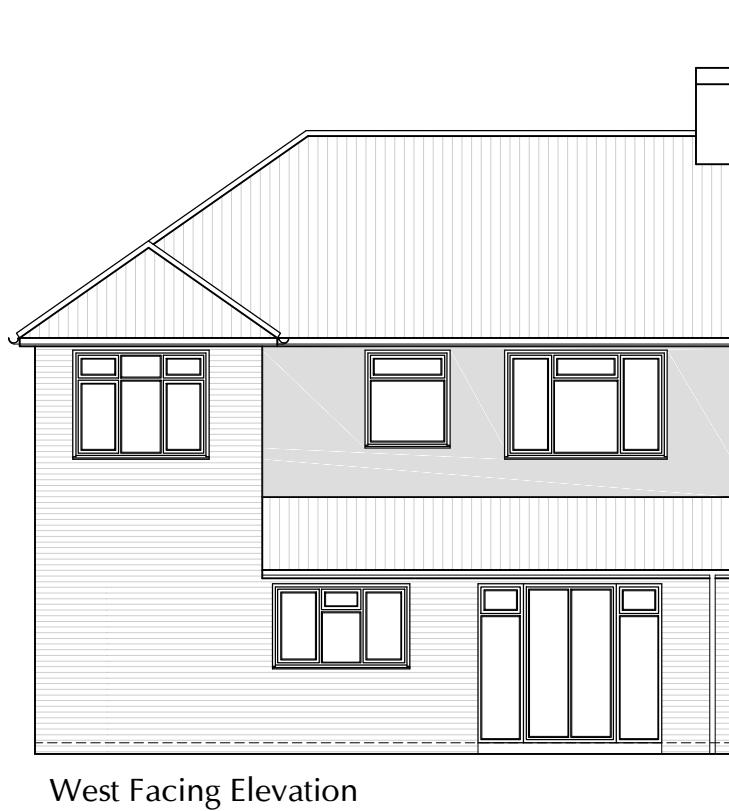
West Facing Elevation