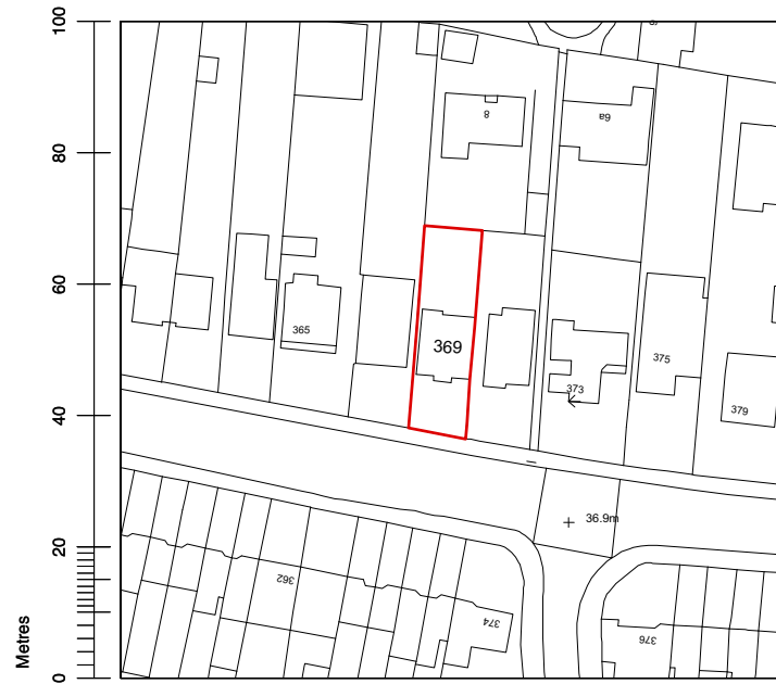
Location Plan. Scale 1:1250