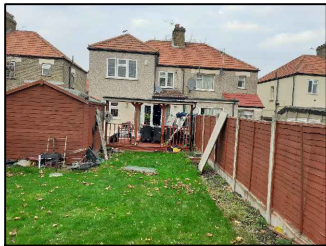
View from Rear Garden