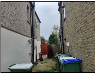
Existing side access [to remain]