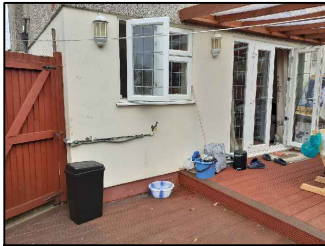
View of Rear Kitchen Window, and Dining RM Patio doors