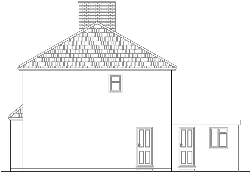
EXISTING AND PROPOSED SIDE ELEVATION