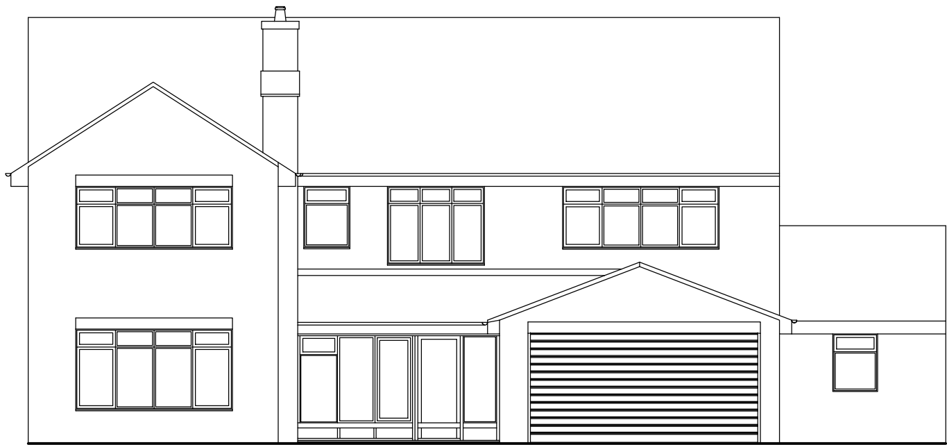
Existing Front Elevation scale 1:100@A3