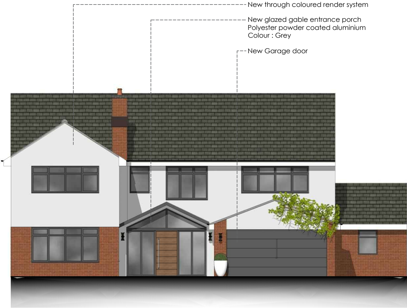
Proposed Front Elevation scale 1:100@A3