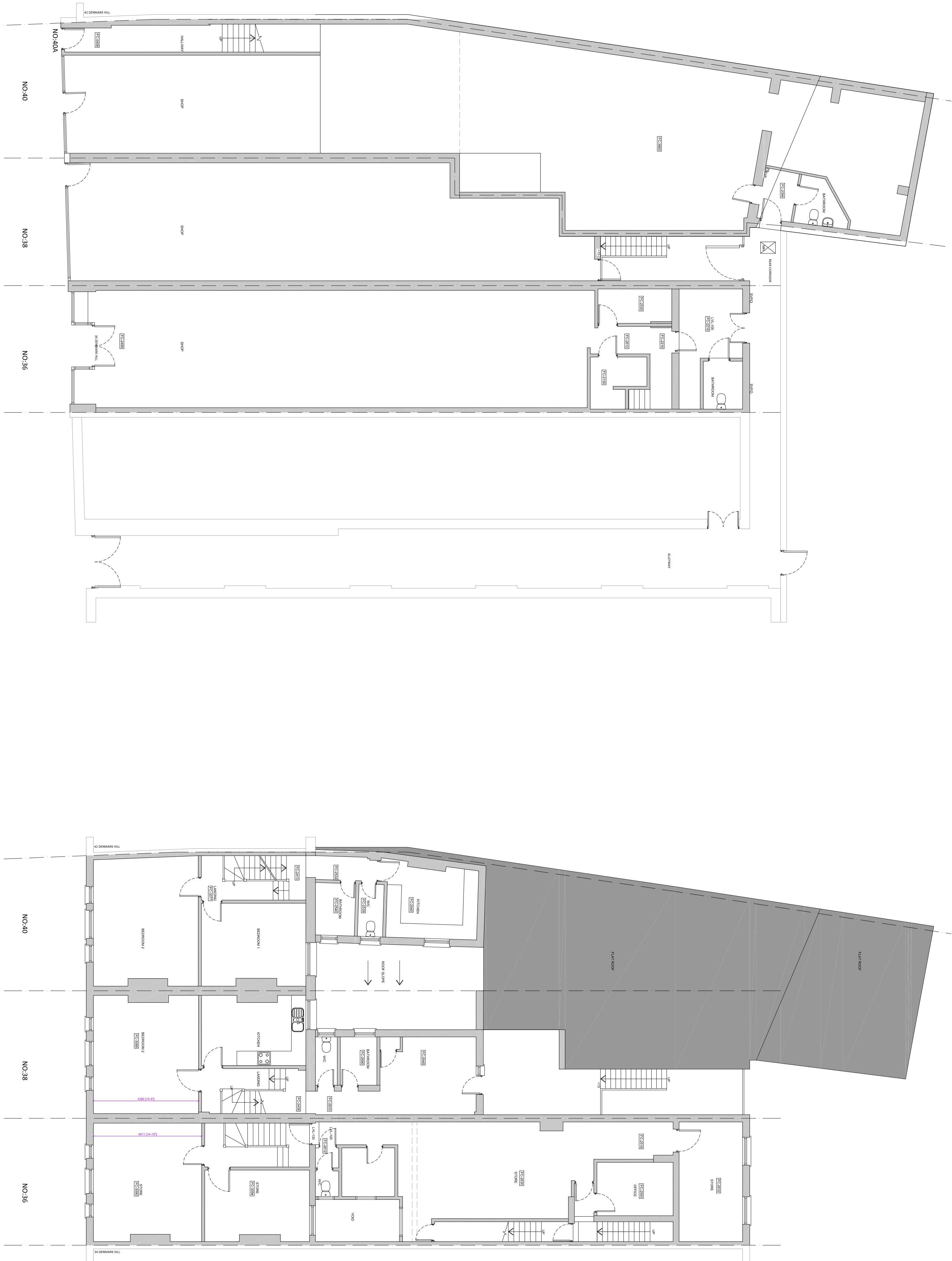
EXISTING GROUND FLOOR PLAN SCALE 1:100