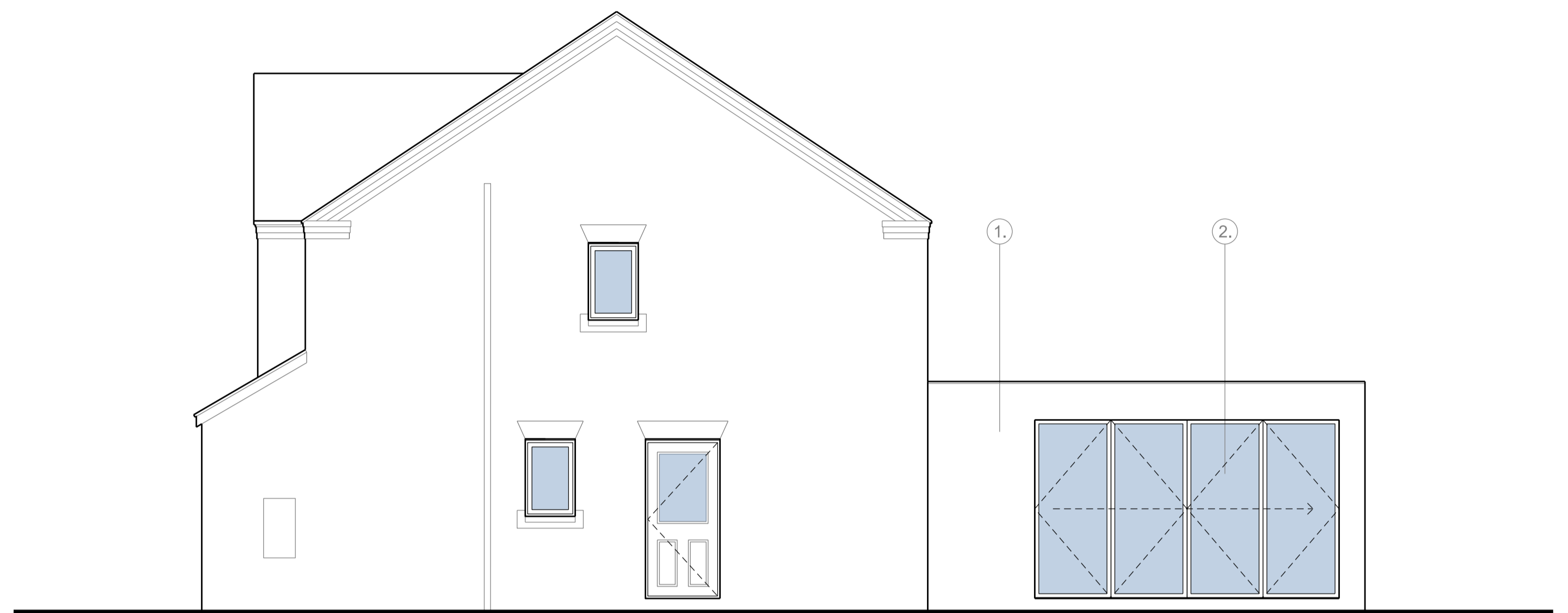
PROPOSED: NORTH WEST ELEVATION Scale 1:50 at A1