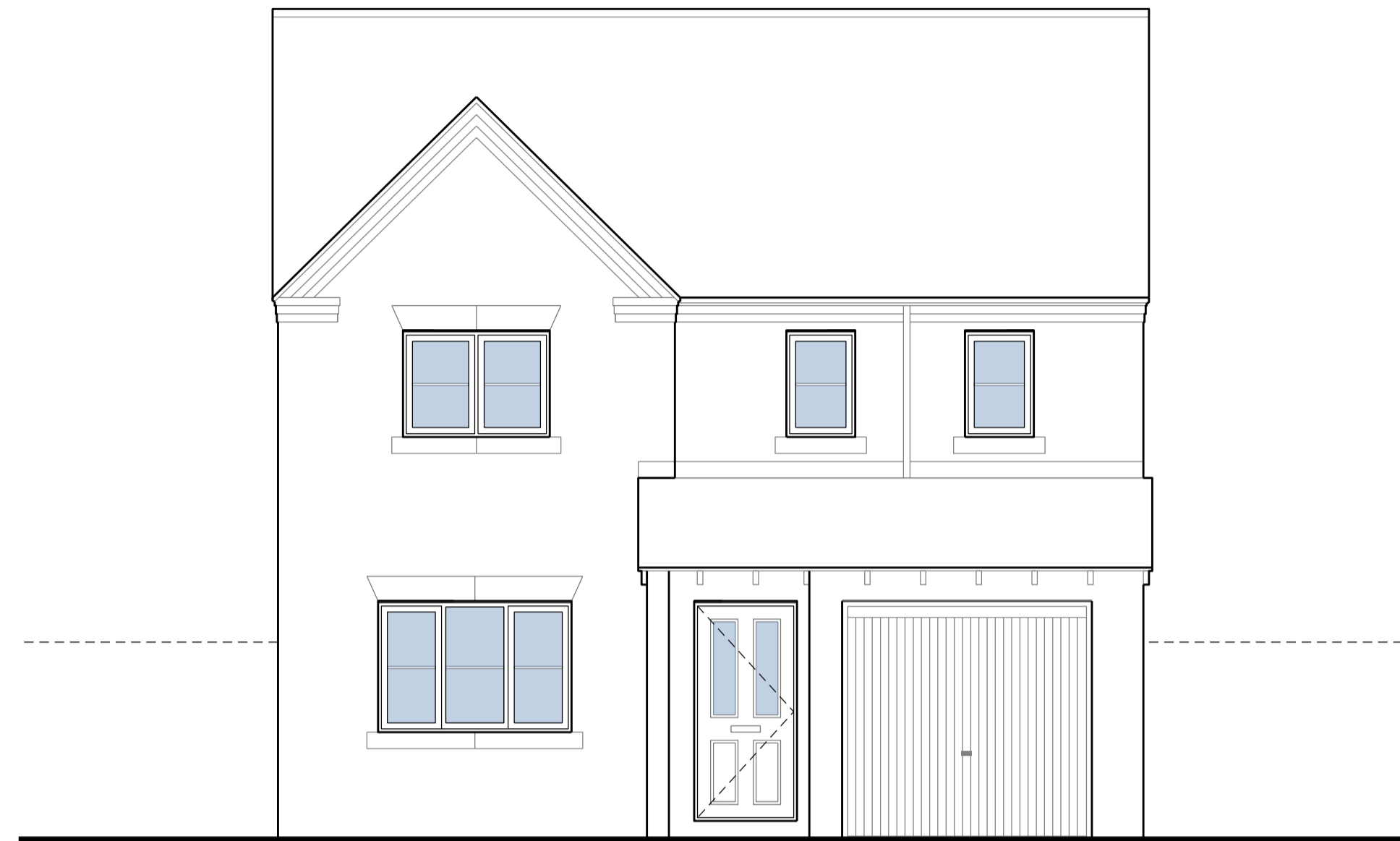
EXISTING: NORTH EAST ELEVATION Scale 1:50 at A1