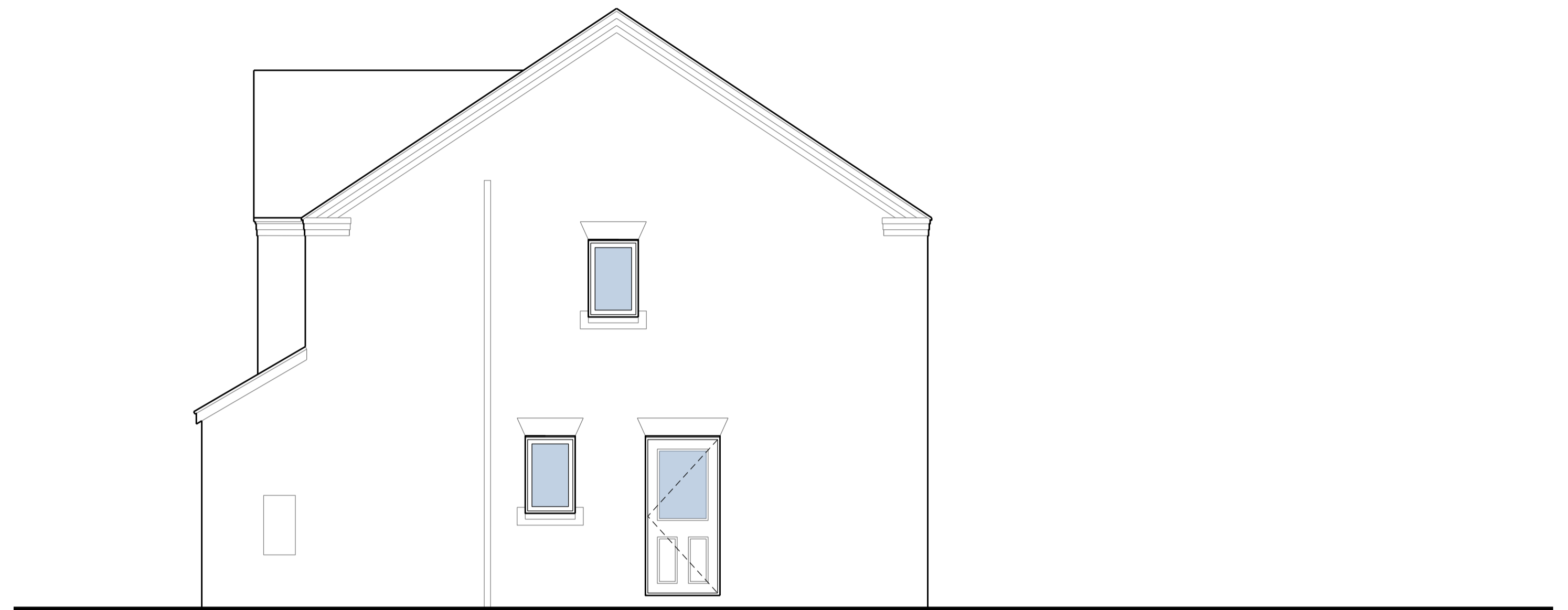
EXISTING: NORTH WEST ELEVATION Scale 1:50 at A1