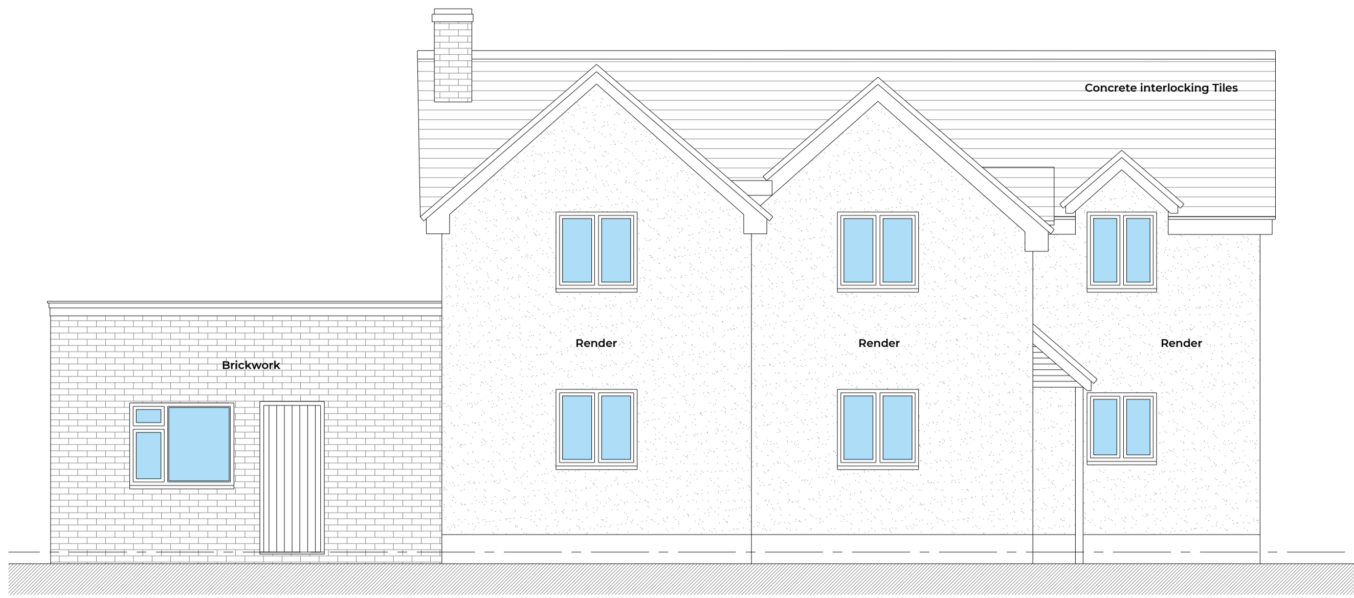
Existing North West Elevation Scale 1:50

NOTES Do not scale from this drawing. All figured dimensions are in mm and to be checked on site prior to construction works. Any items manufactured off site are the sole responsibility of the manufacturer for their design and fitting. Copyright of the design and / or drawings remains solely with the agent.