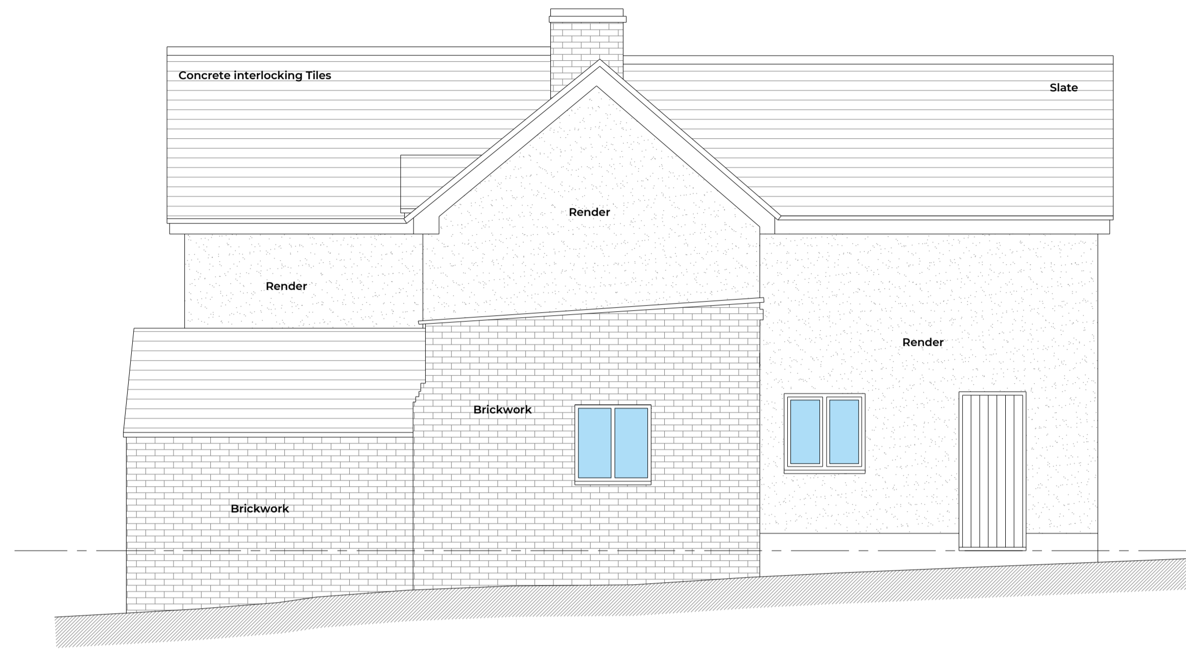
Existing North East Elevation Scale 1:50