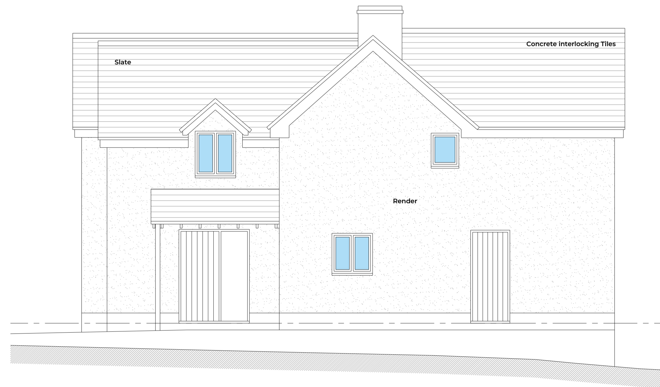
Existing South West Elevation Scale 1:50