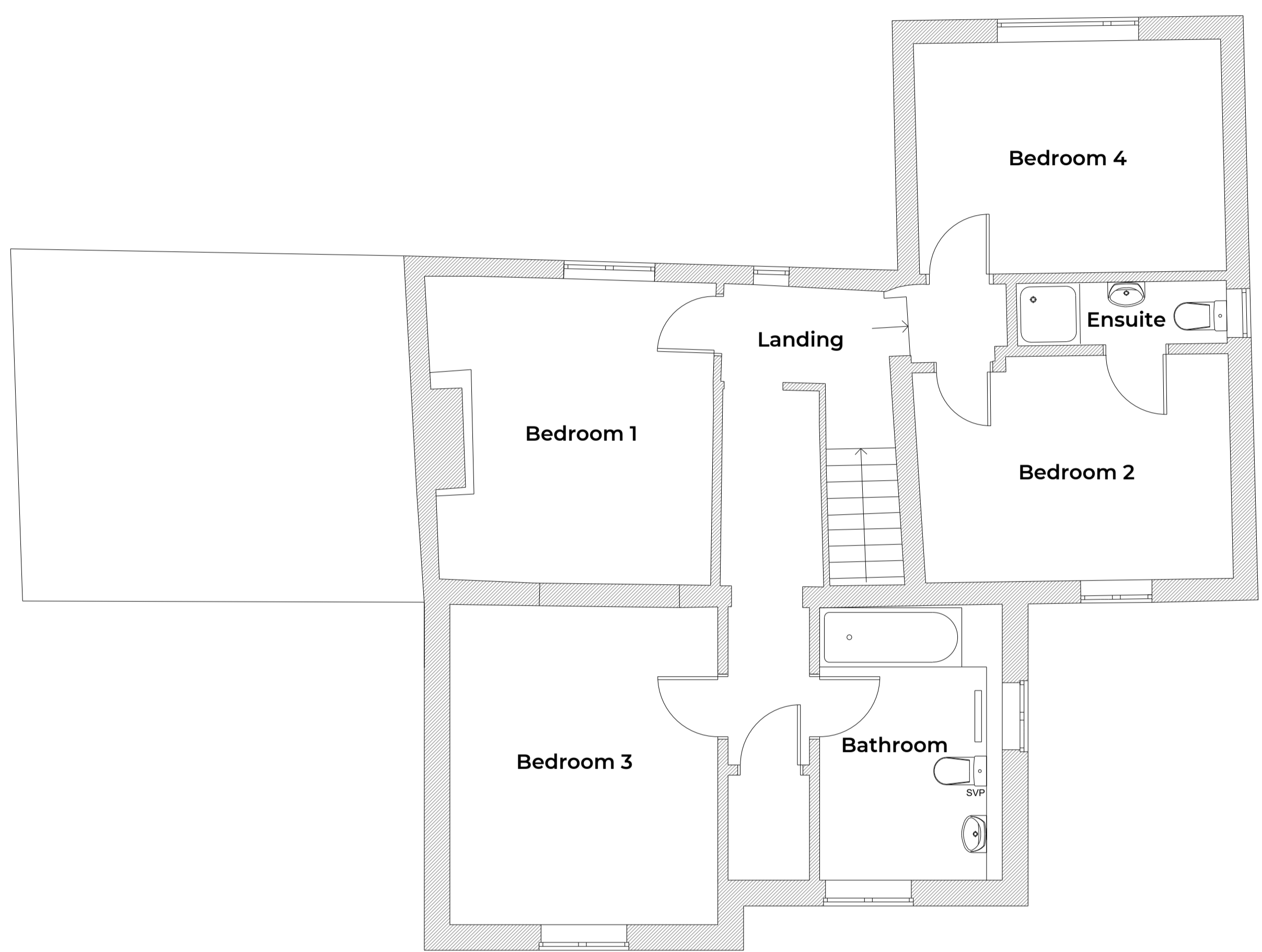
Existing First Floor Plan Scale 1:50