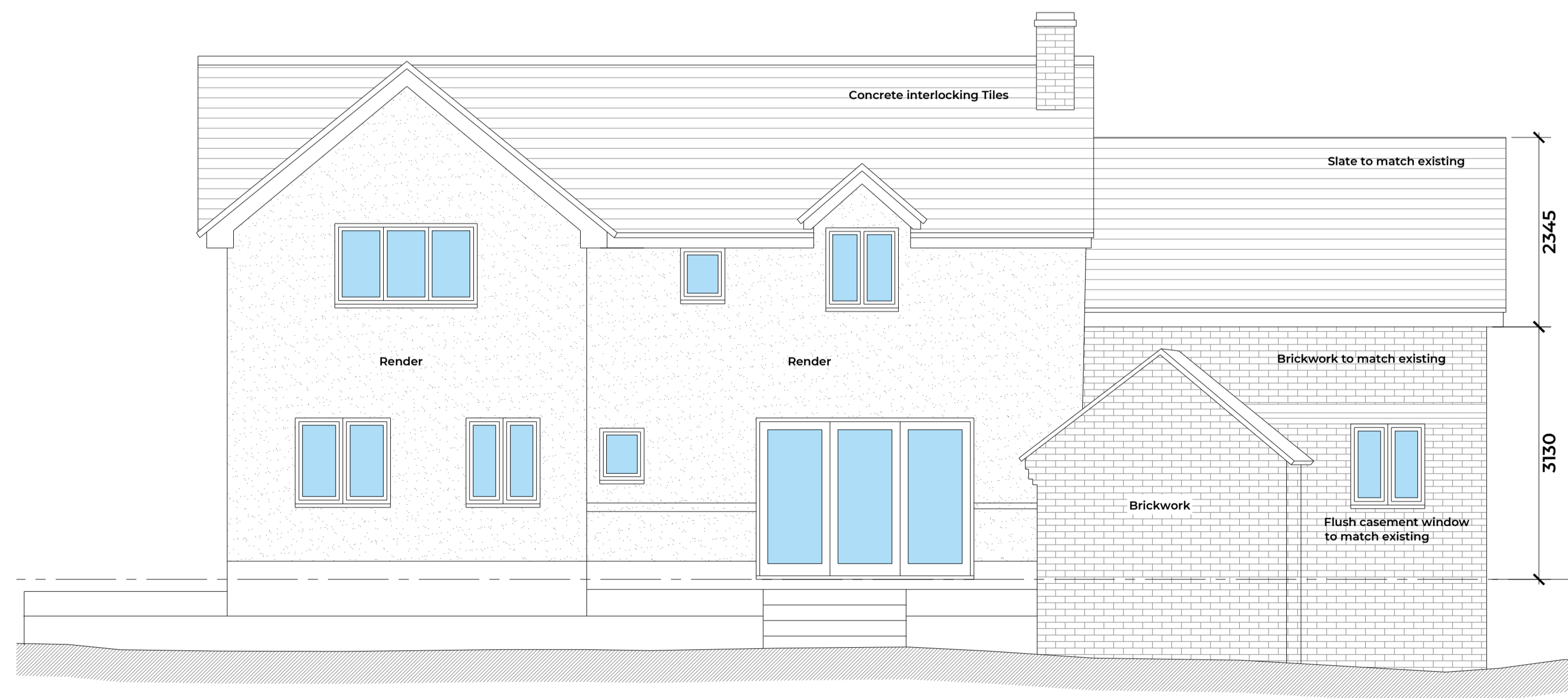
Proposed South East Elevation Scale 1:50