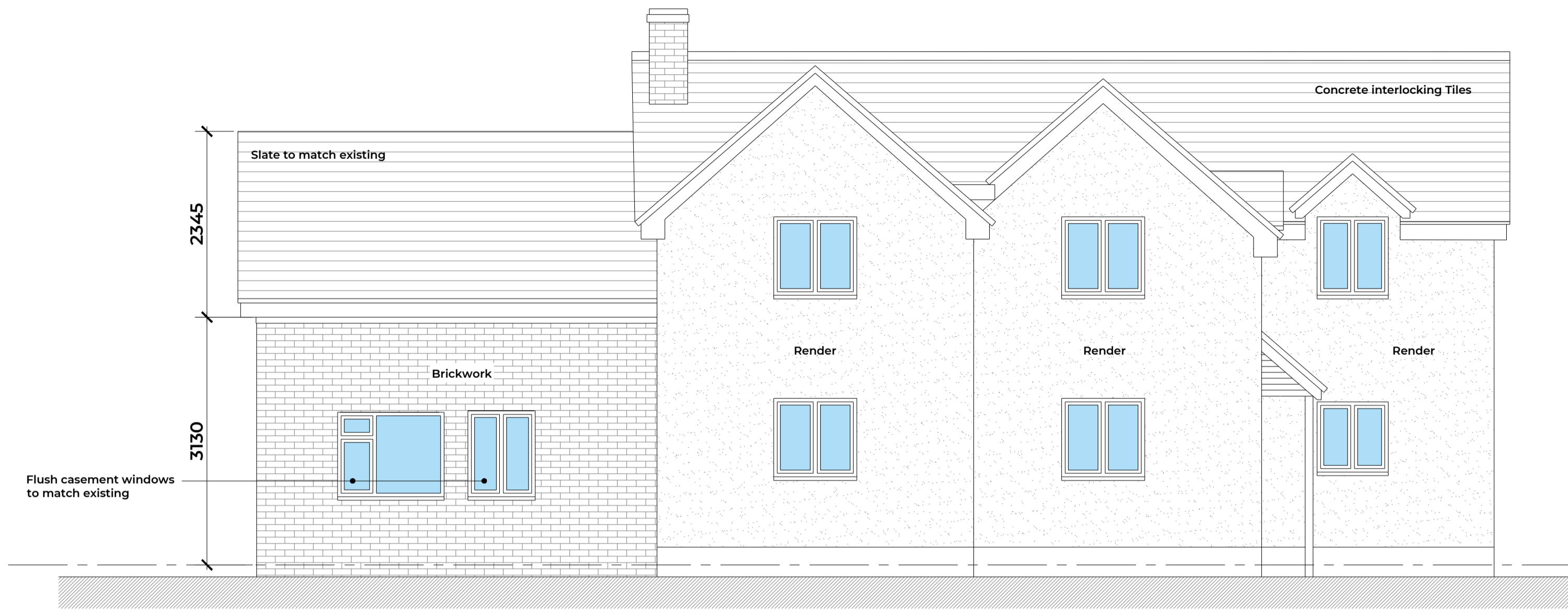
Proposed North West Elevation Scale 1:50

NOTES Do not scale from this drawing. All figured dimensions are in mm and to be checked on site prior to construction works. Any items manufactured off site are the sole responsibility of the manufacturer for their design and fitting. Copyright of the design and / or drawings remains solely with the agent.