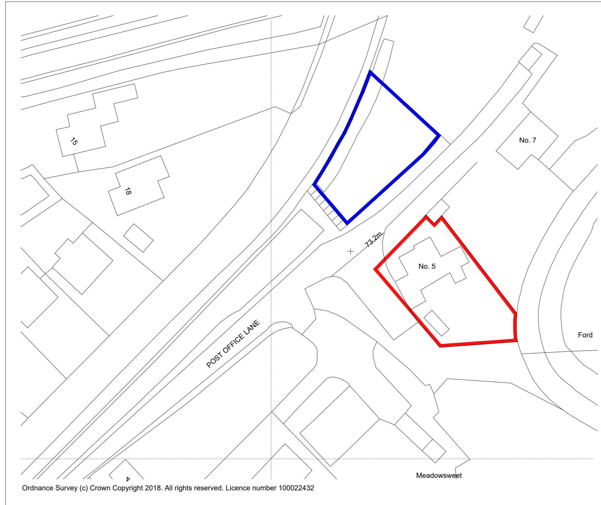
Existing Block Plan Scale 1:500