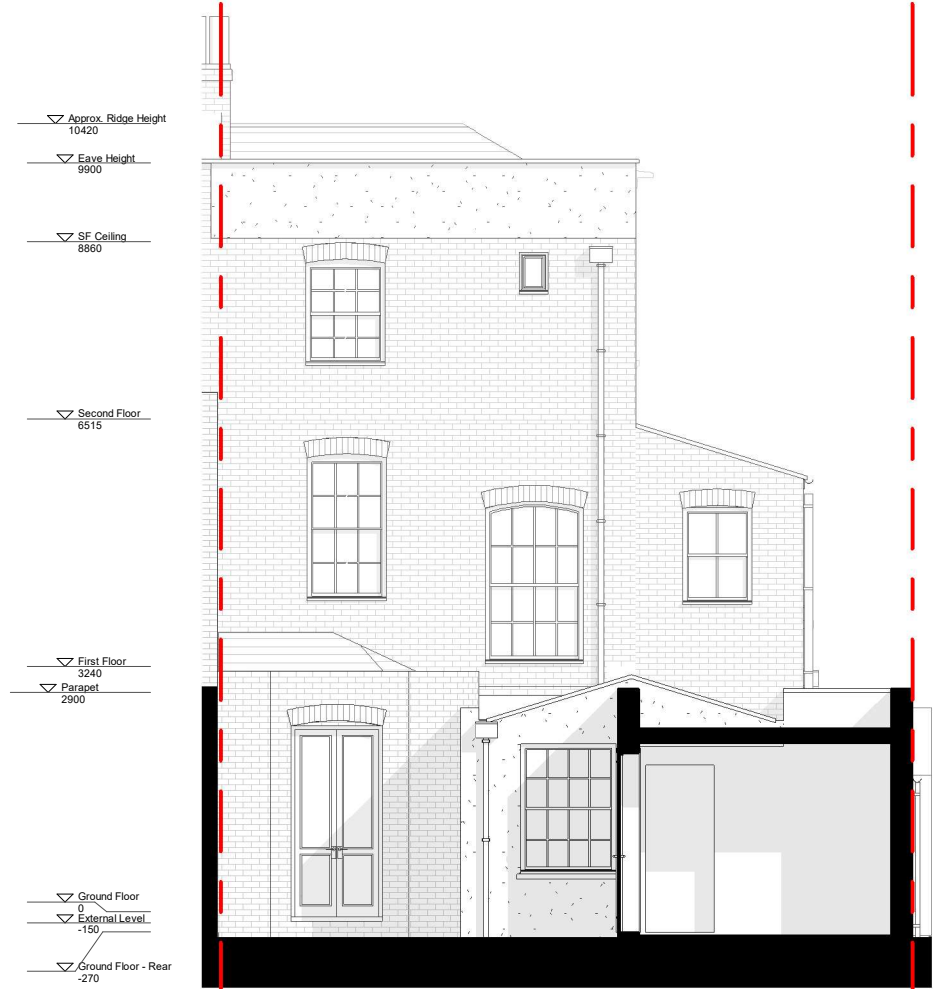
REAR ELEVATION (WEST) 1 : 100

Contractors must work only to figured dimensions which are to be checked on site, any discrepancies are to be reported to the architect before proceeding. All rights described in chapter IV of the copyright, designs and patents act 1988 have been generally asserted. Information contained within this drawing is the sole copyright of Rixon Architecture and should not be reproduced or imparted to a third party without written permission.