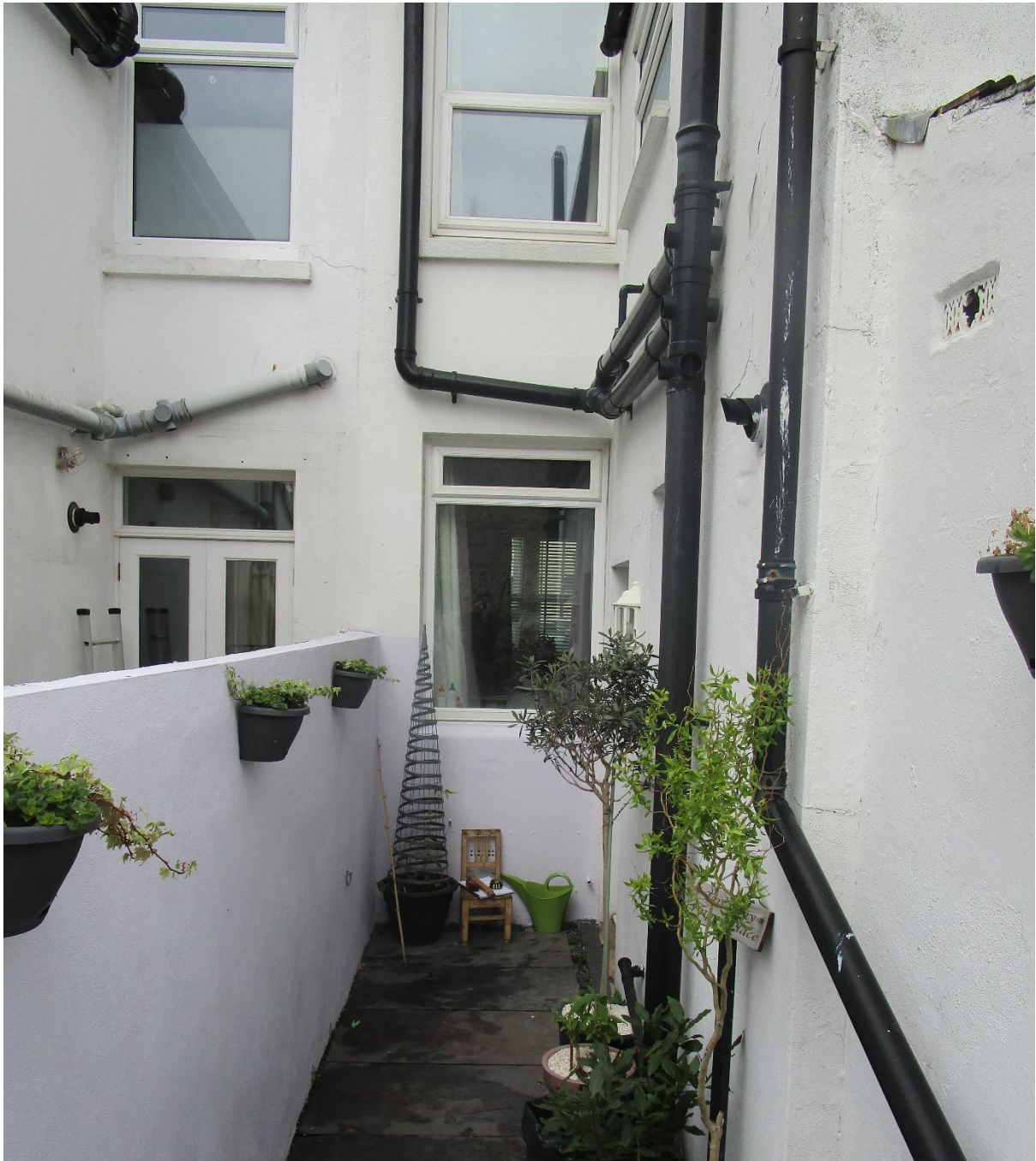
PHOTO 02 View of side return