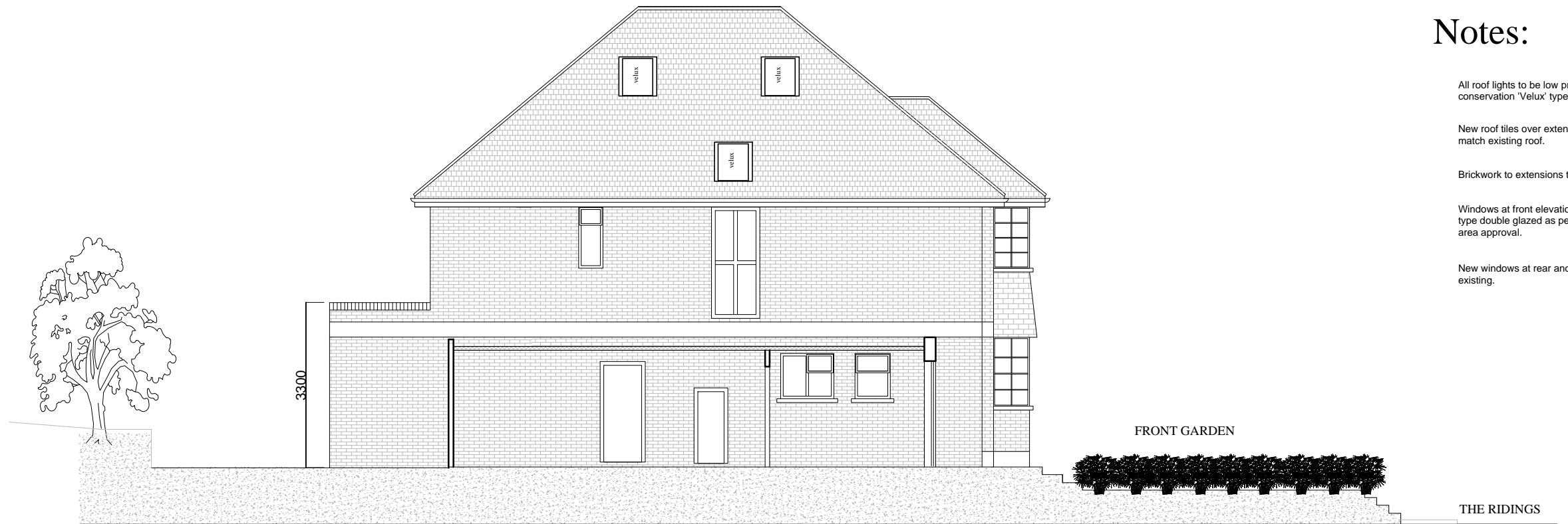
SIDE (SOUTH-EAST) ELEVATION

New windows at rear and sides to match existing.