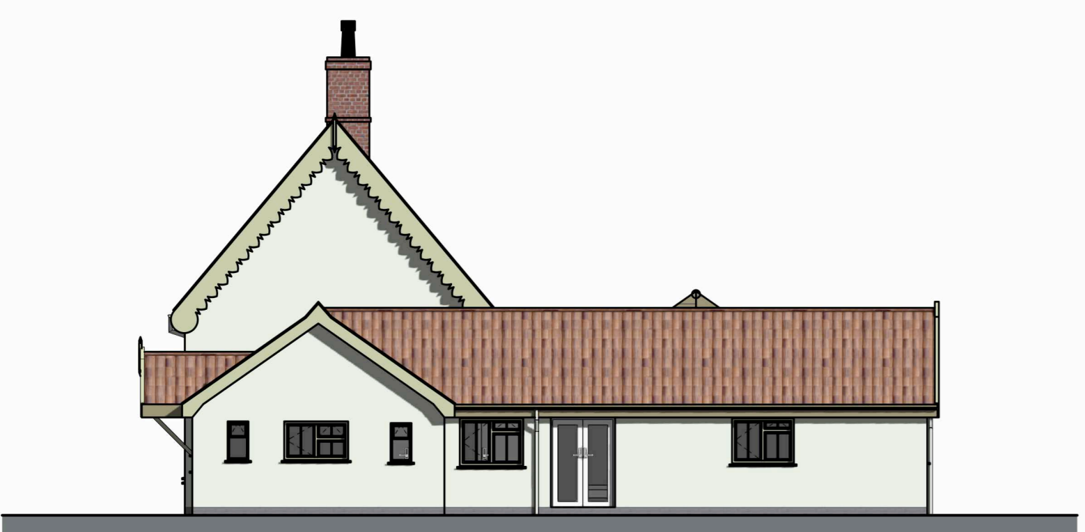
West Elevation Scale 1:100