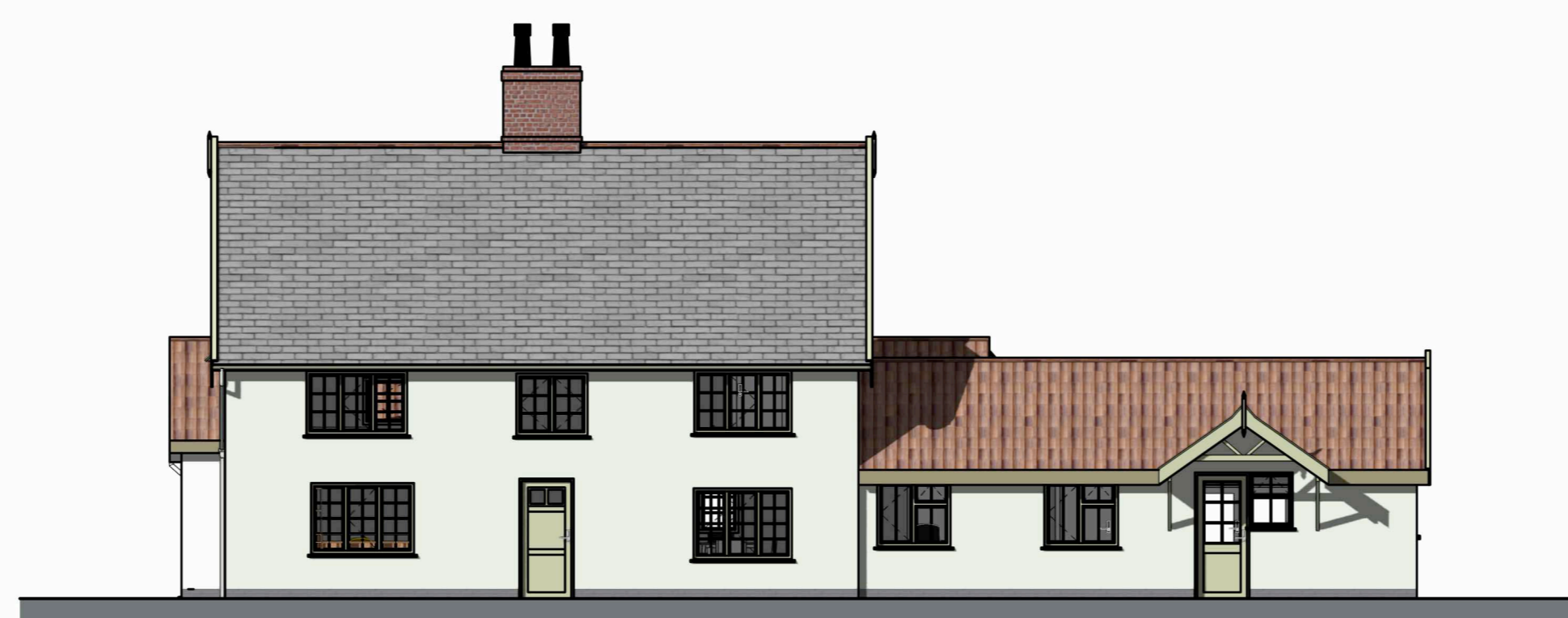
North Elevation Scale 1:100