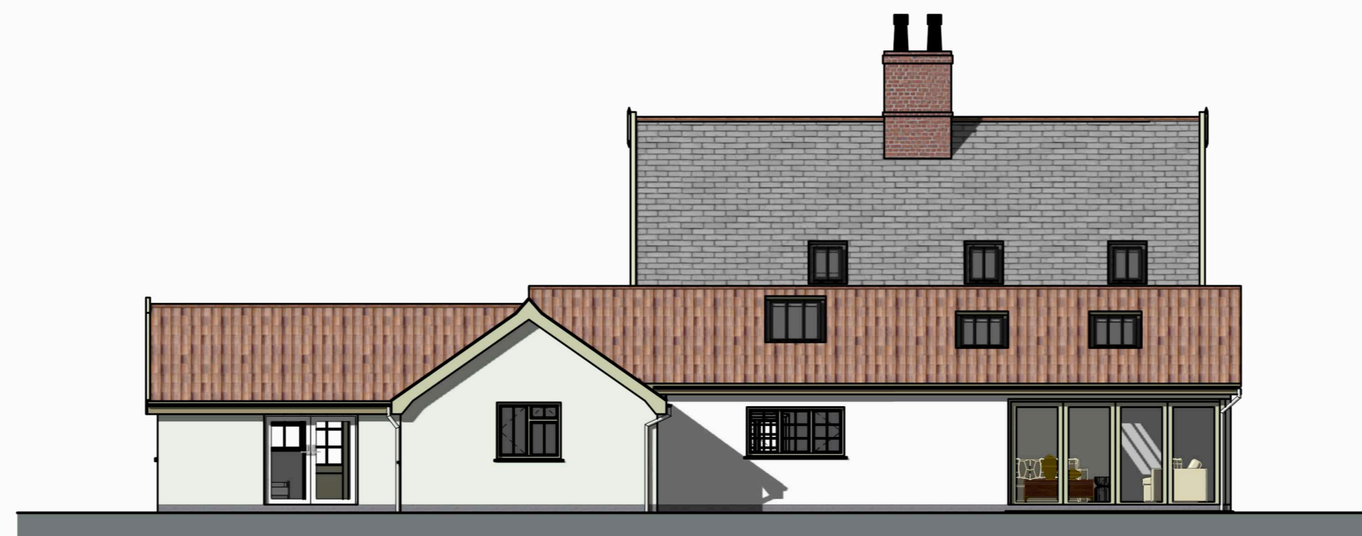
South Elevation Scale 1:100