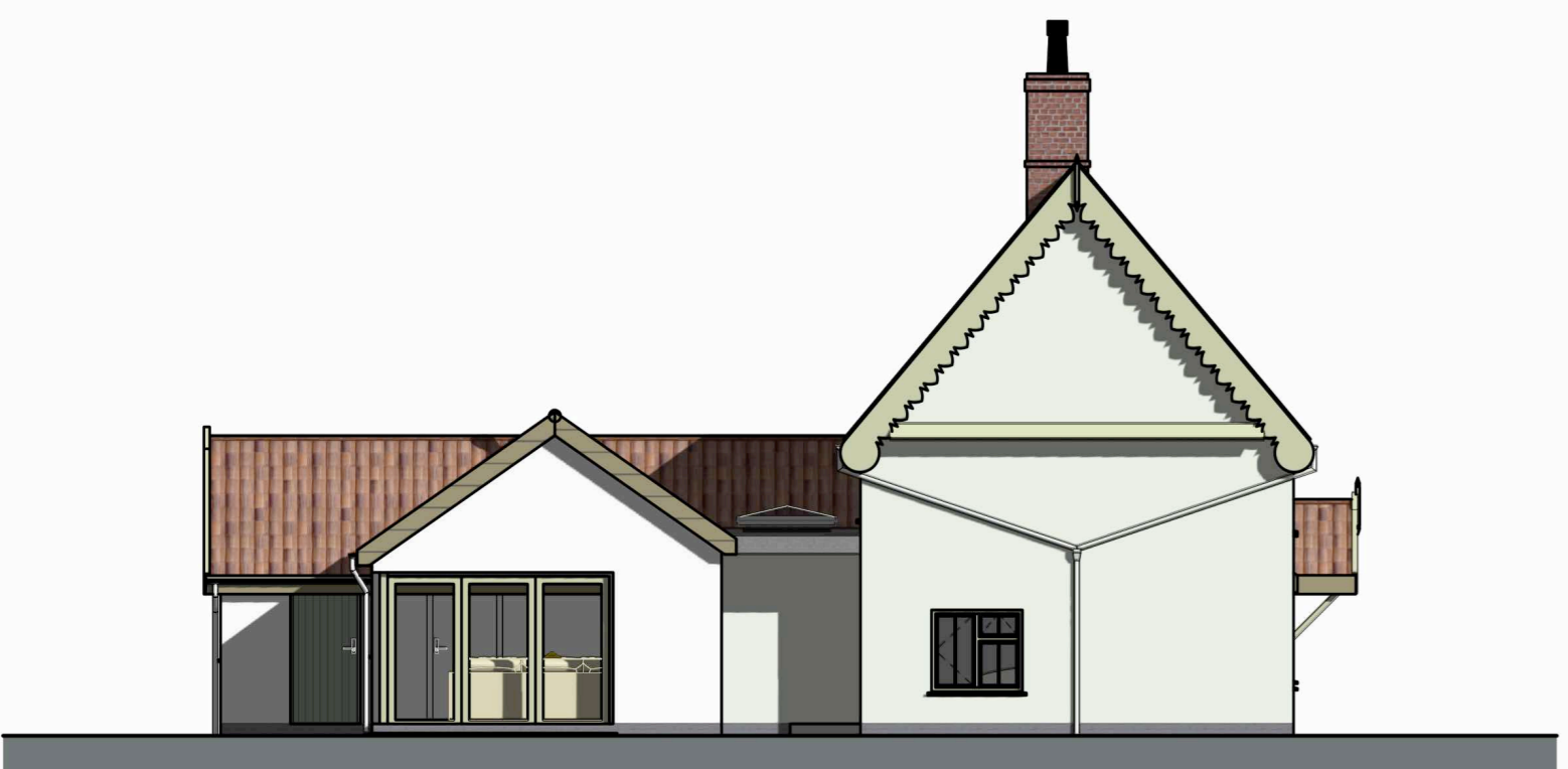
East Elevation Scale 1:100