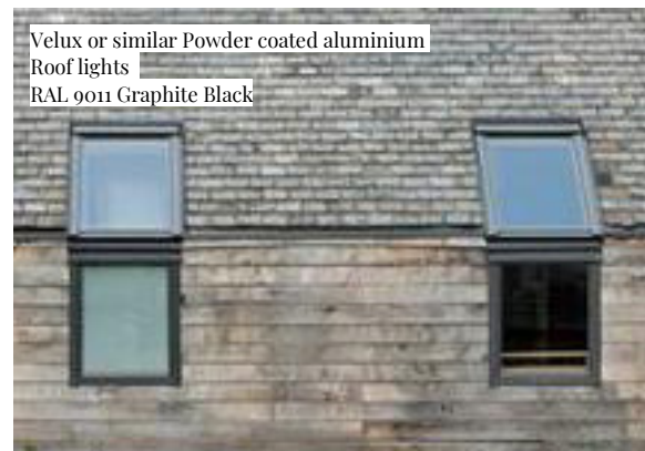
Velux or similar Powder coated aluminium Roof lights RAL 9011 Graphite Black