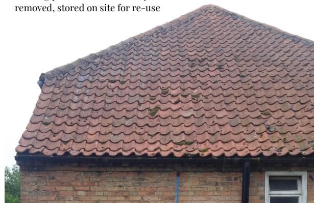
Existing pantiles to be carefully removed, stored on site for re-use