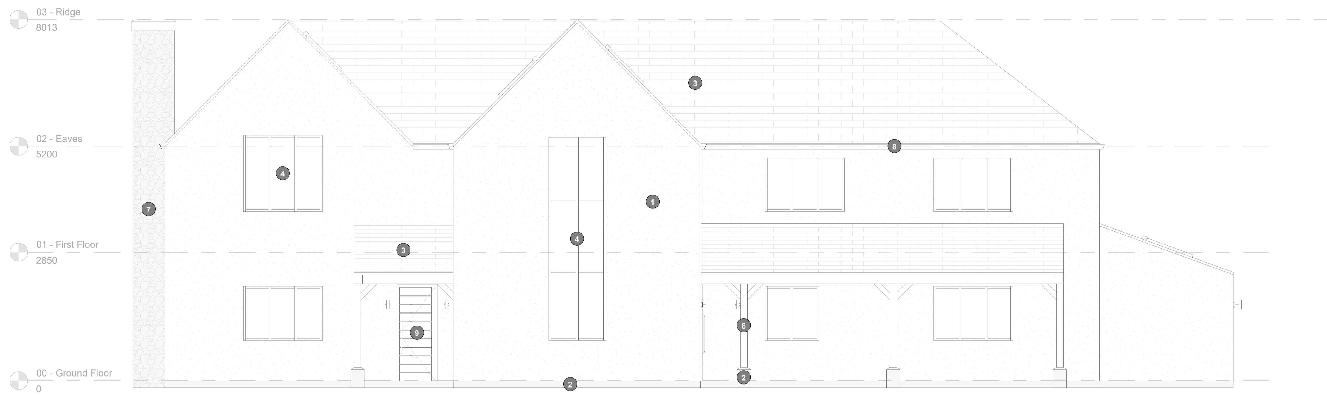
Proposed North Elevation Scale 1 : 50