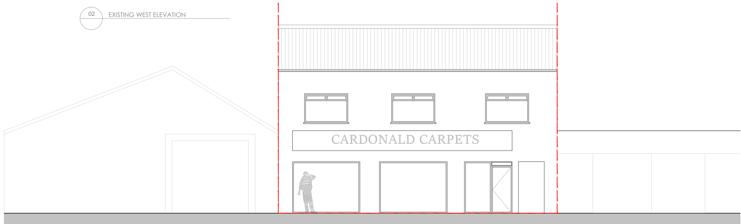
02 EXISTING WEST ELEVATION

Notes: - Do not scale from this drawing - All dimensions are to be checked on site prior to construction. - Dimensions marked with an asterisk thus * are open site dimensions to be confirmed on site. - Should any discrepancy be found with this drawing please report to this office immediately. - The copyright of all information contained within this drawing subsides with block 9 architects.