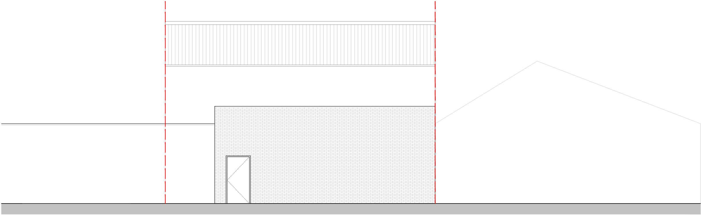
1 EXISTING REAR ELEVATION